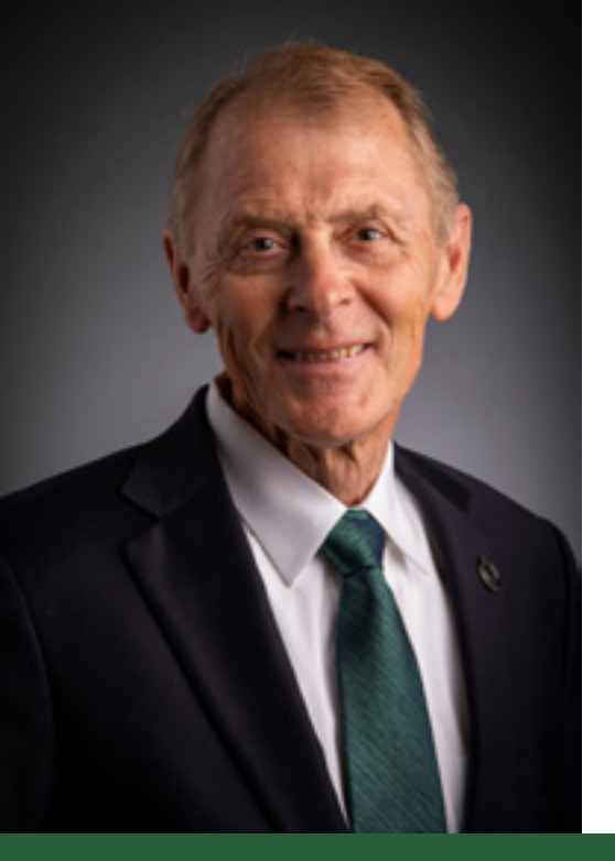
February 27, 2020