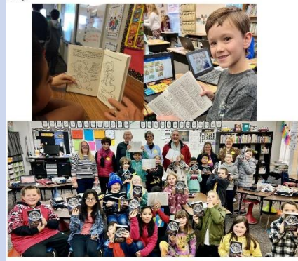
St. George Sunrise Club promotes literacy efforts in our schools across Washington County from the Dictionary project, to backpack distribution and of course our Reading Skills Program at Sunset School. Rotary is the vehicle to address so many issues in our world, Literacy being just one of many.

This is the largest fundraiser of the year for our club.