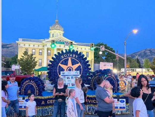
Brigham City Rotary Club's float at Peach Days.

and fruit tree planting in Eastern Uganda and Nakivale project areas.