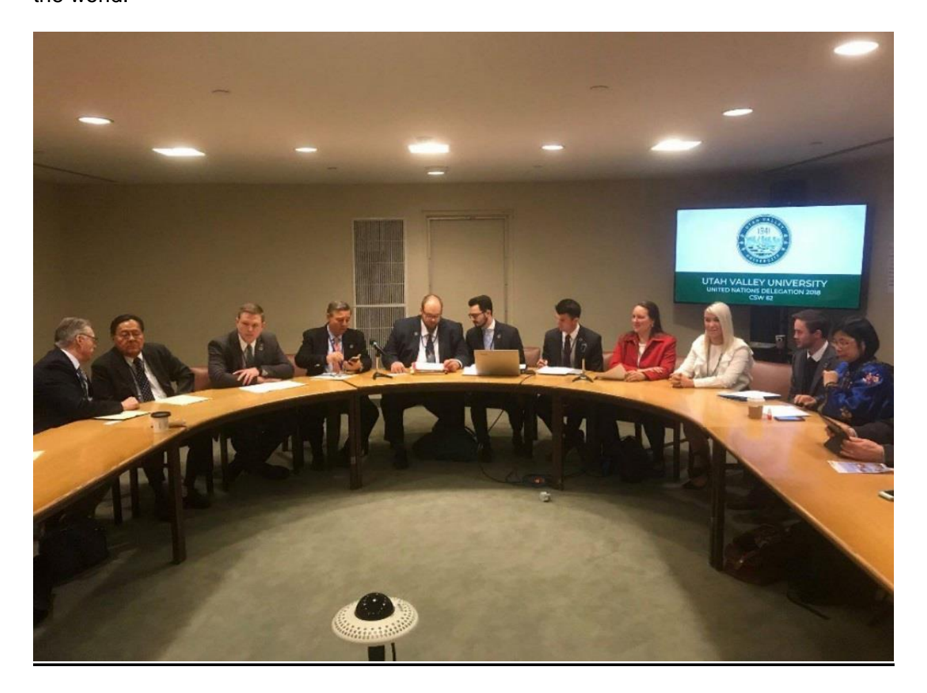
UVU Students and Faculty during side event at CSW62

promote and advocate for their causes in relations to women and the roles they play in the world.