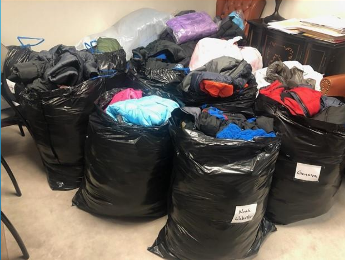
Coats being sorted before delivery