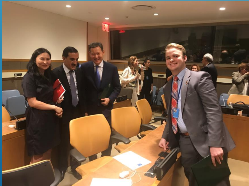
Meeting with PRs of Kyrgyzstan to the UN, Tajikistan to the UN and Kazakhstan to the UN