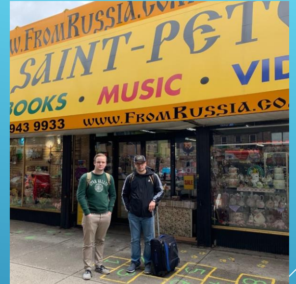
Visit to Brighton Beach