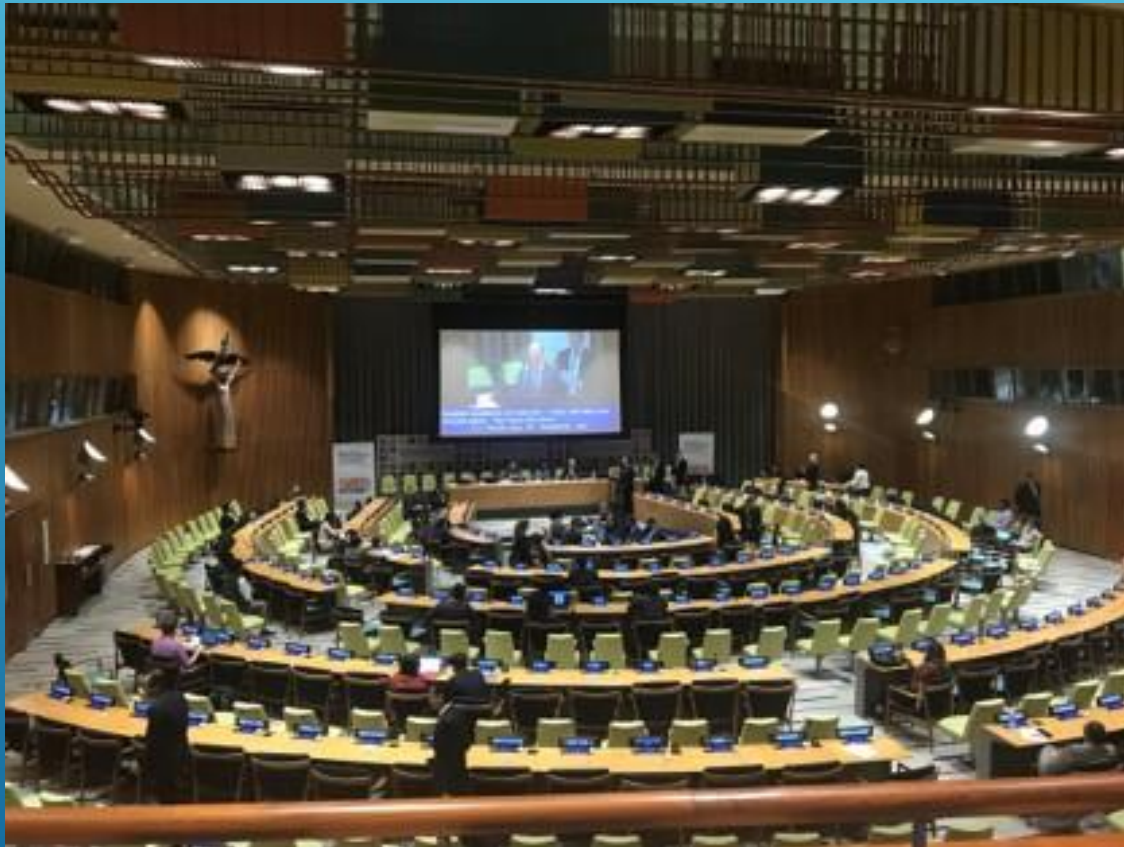
UIMF MEMBERS AT HIGH-LEVEL POLITICAL FORUM, UN TRUSTEESHIP COUNCIL CHAMBER, JULY 18, 2018

HLPF 2018 – “Transformation towards sustainable and resilient societies”