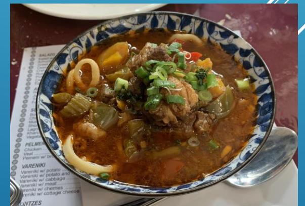
This is Central Asian dish - lagman