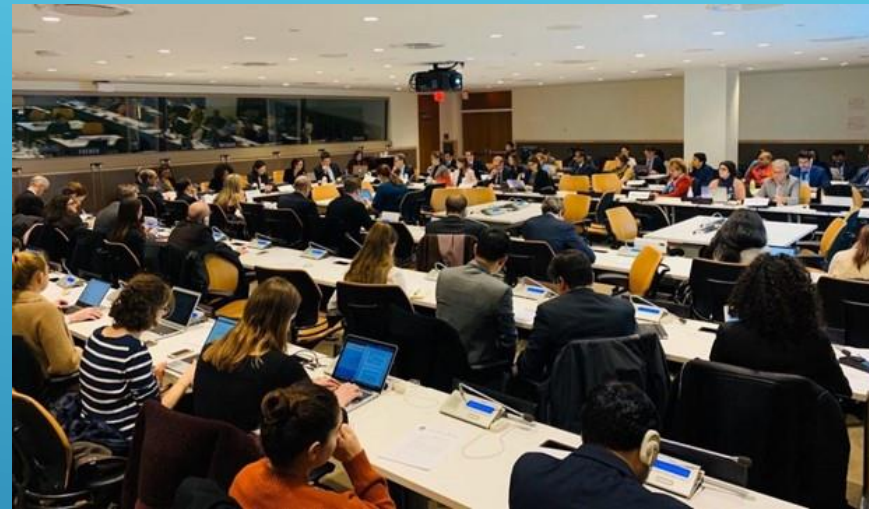
Attendees of the International Mountain Day observation at the United Nations headquarters