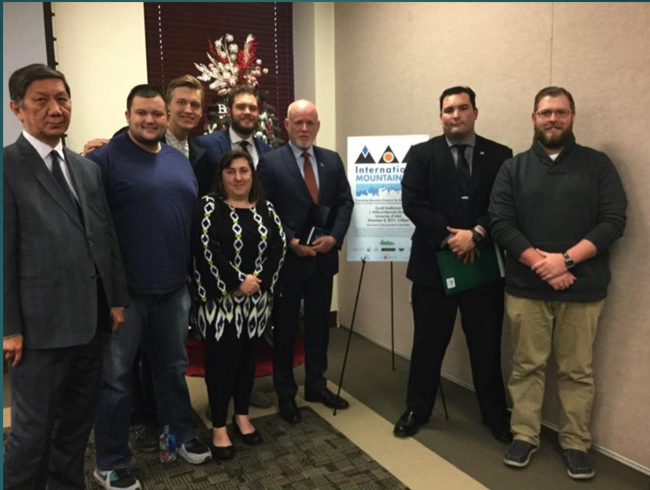
President of the United Nations General Assembly, Permanent Representative of Fiji to the UN, Ambassador Peter Thomson during a presentation at Utah Valley University, December 7, 2015