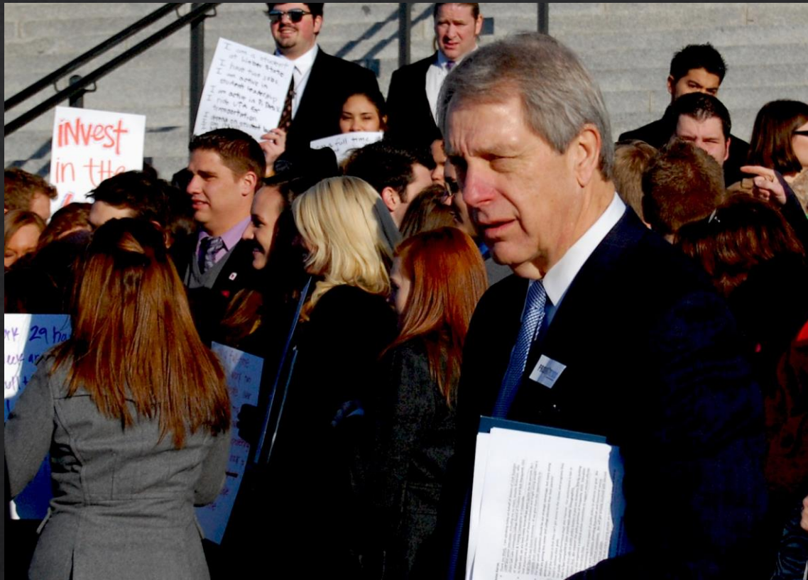
On February 4, 2012 over 200 students and business leaders including UIMF leaders, gathered on the steps of the Utah state capital to rally in support of funding for Utah's higher education