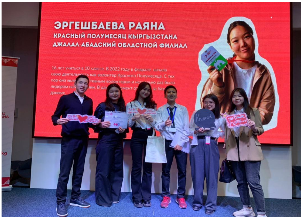
Photo from a charity event organized in 2023 together with the Red Crescent

Our club, had collaboration with the national government, actively engages in youth-centric initiatives and is a proud member of the Union of Youth Organizations of our country. Established in 2017 by the Rotary Club of Bishkek, our club has spearheaded numerous projects across a spectrum of areas, from social outreach to international cooperation. All proceeds are channeled into charitable endeavors, supporting single mothers, orphans, and large families.