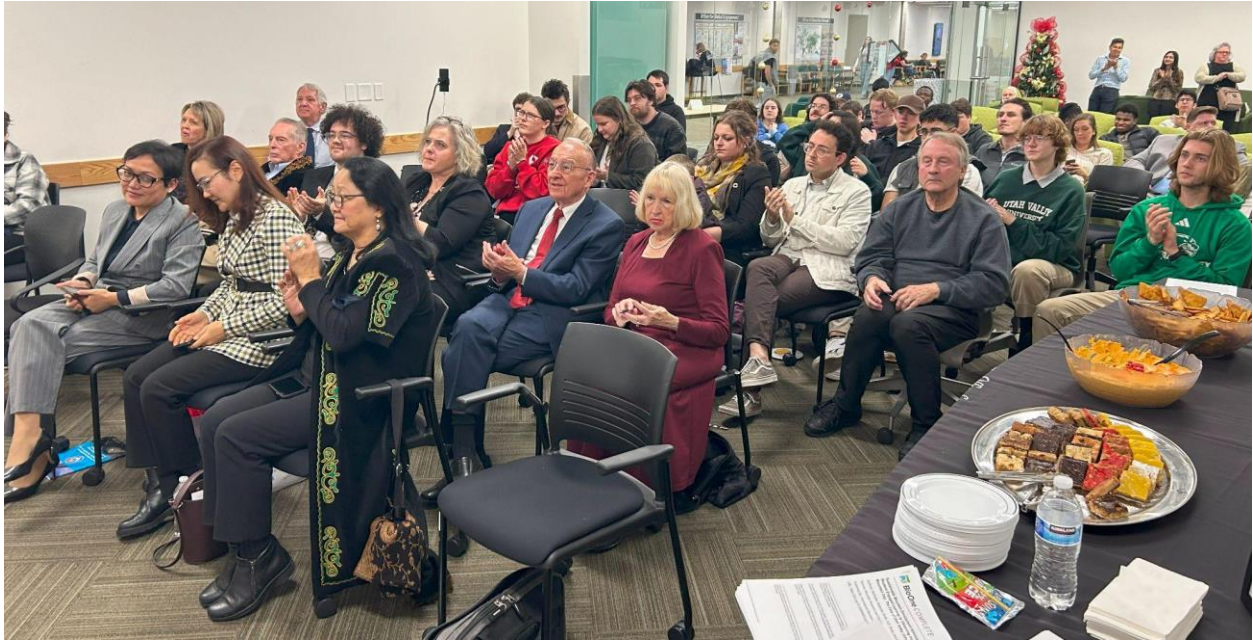
UVU faculty and students in the audience