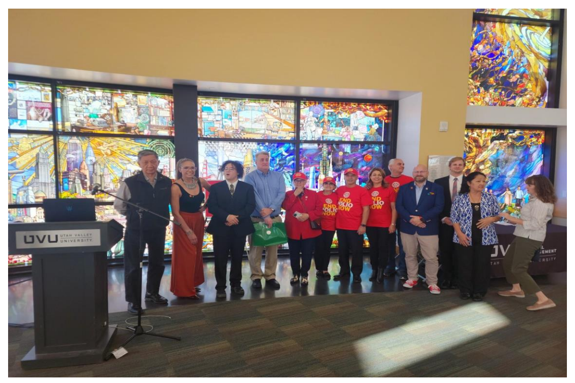
Group photo of the WPD Event