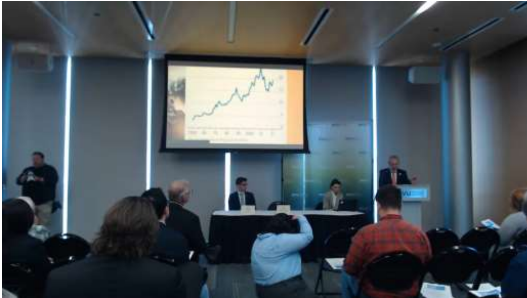
H.E. Mr. Csaba Korosi, President of the 77 th of UN General Assembly

Next, he emphasized on Climate change . Even though it does not have a causal relationship with a crisis, it is a phenomenon that can trigger one. There are many traditional conflicts that have erupted due to the change in climatic conditions. It is said that for every 1-degree rise in temperature, it increases the chance of conflict by 11%. Human Trafficking also is another major crisis happening all over the world, especially in vulnerable places where other types of crises are already prevalent.