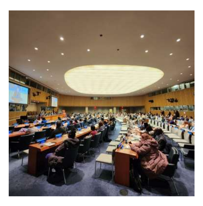
A crowded room watches a side event presenting on peace education for women and girls.