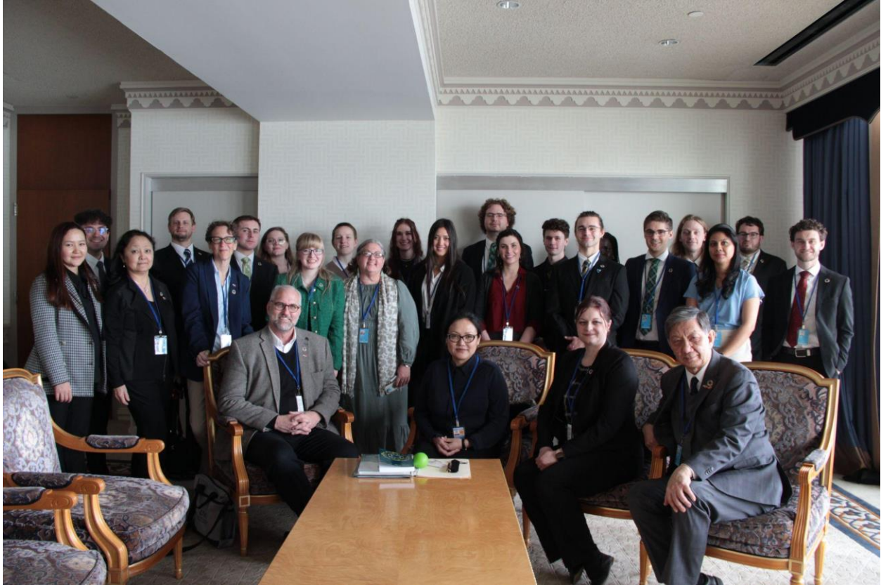
UIMF Delegation meeting with Aida Kasymalieva, the Permanent Representative of the Kyrgyz Republic to the United Nations

“Wisdom of Royal Glory (Kutadgu Bilig)” by Yusuf Khas Hajib is a remarkable book written in 1069 as a mirror for princes, offering advice on how to rule. The principles amidst the pages of the book emphasize the duality of worldly wisdom and religious values in political societies. Both paths acknowledge the other and, according to Yusuf Khas Hajib’s political theories, are needed. I have enjoyed studying this text personally and