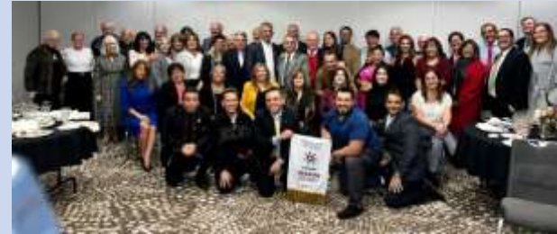
The Hispanic Latino Club of Salt Lake City recently held a very successful celebration of the clubs 15-year Anniversary.