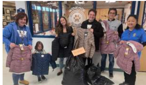
Orem-Lindon Rotarians and UVU Rotaractors delivered 254 coats to children in need at 8 elementary schools in Orem.

This marks the tenth-year of Orem-Lindon Rotarians contributions of efforts and funds to the service project, "Coats for Kids" and the third year to do this jointly with Rotaractors.