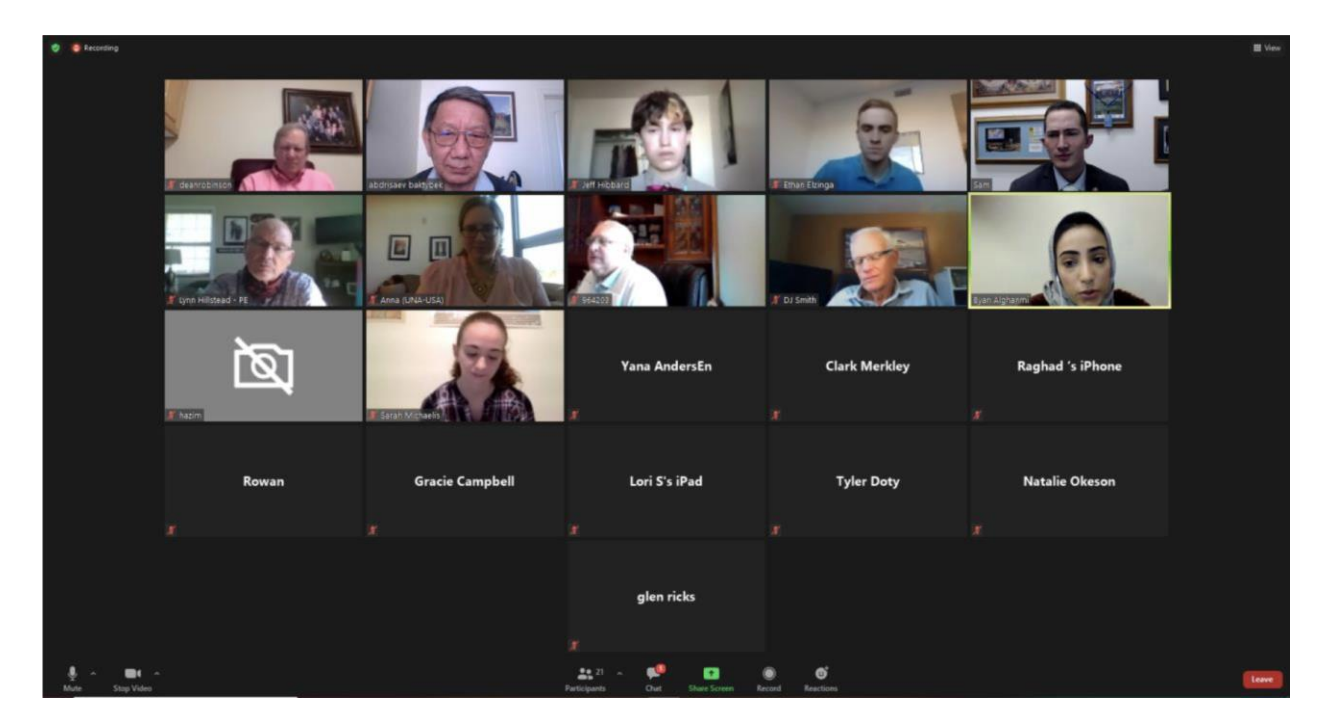
Participants of the IMD 2020 Observation at UVU

The Utah International Mountain Forum (UIMF), a coalition of student clubs at Utah Valley University (UVU) hosted the 11<sup>th</sup> annual International Mountain Day (IMD) observation virtually via a live stream on the UIMF Facebook page. The event was highly effective at spreading awareness for underrepresented mountain communities across the world. As this event was able to be held online, the UIMF maintained their consistency to annually observe International Mountain Day despite the challenges presented by COVID-19.