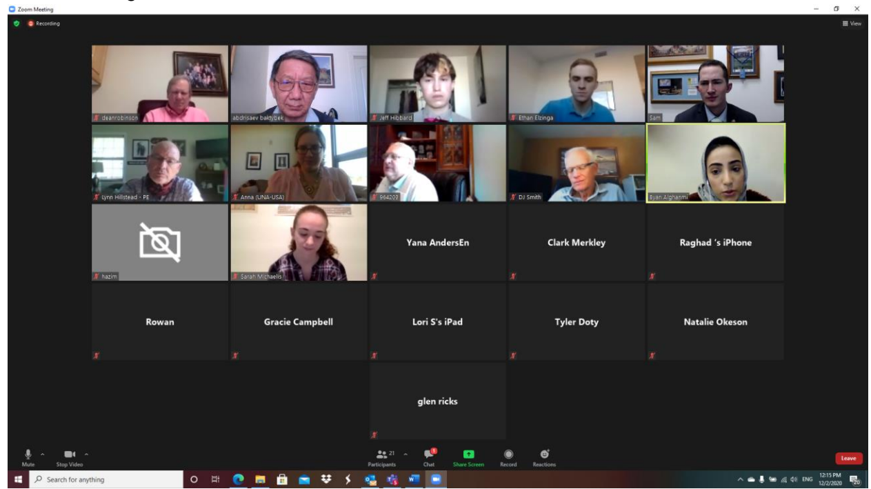
Participants of the IMD 2020 observation at UVU

The 11th annual International Mountain Day (IMD) observation at Utah Valley University, (UVU), was a wonderful way for me to learn about the importance of mountain communities and how we as students can contribute to Sustainable Mountain Development (SMD). The focus of this year's event was the importance of preserving biodiversity in mountains. This is especially relevant to UVU students given our community's close proximity to and reliance on the Wasatch mountain ranges.