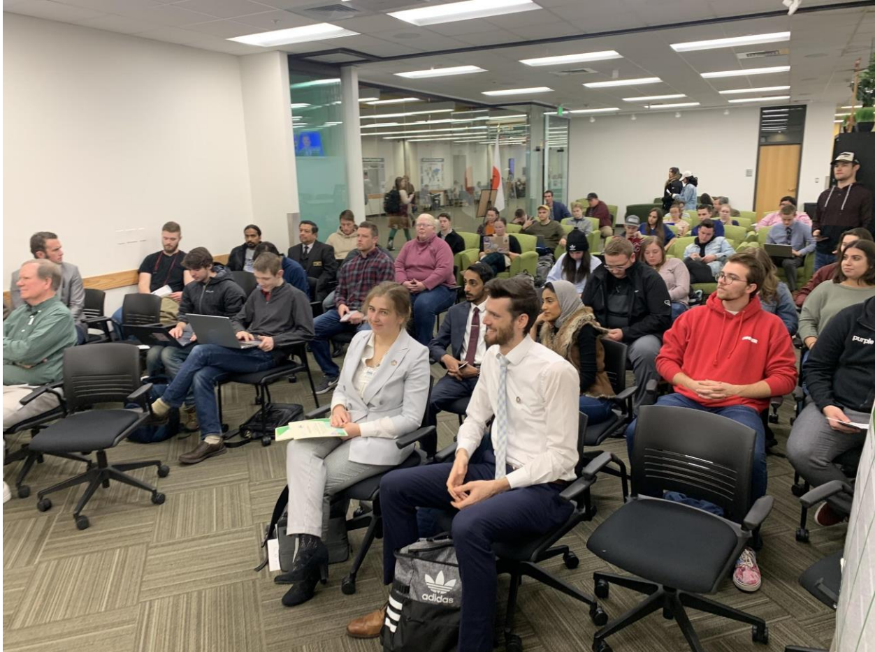
Students, professors, and academic persons engaging in the effort of “Rural Utah” by attending speeches regarding “Rural Utah”.

and being able to have an educated and well put together voice in serious, high critical situations is important. Another thing being how we can relate to climate and understand climate issues we're facing. Overall, it's important to be educated and aware of what's happening and know how to at least help.