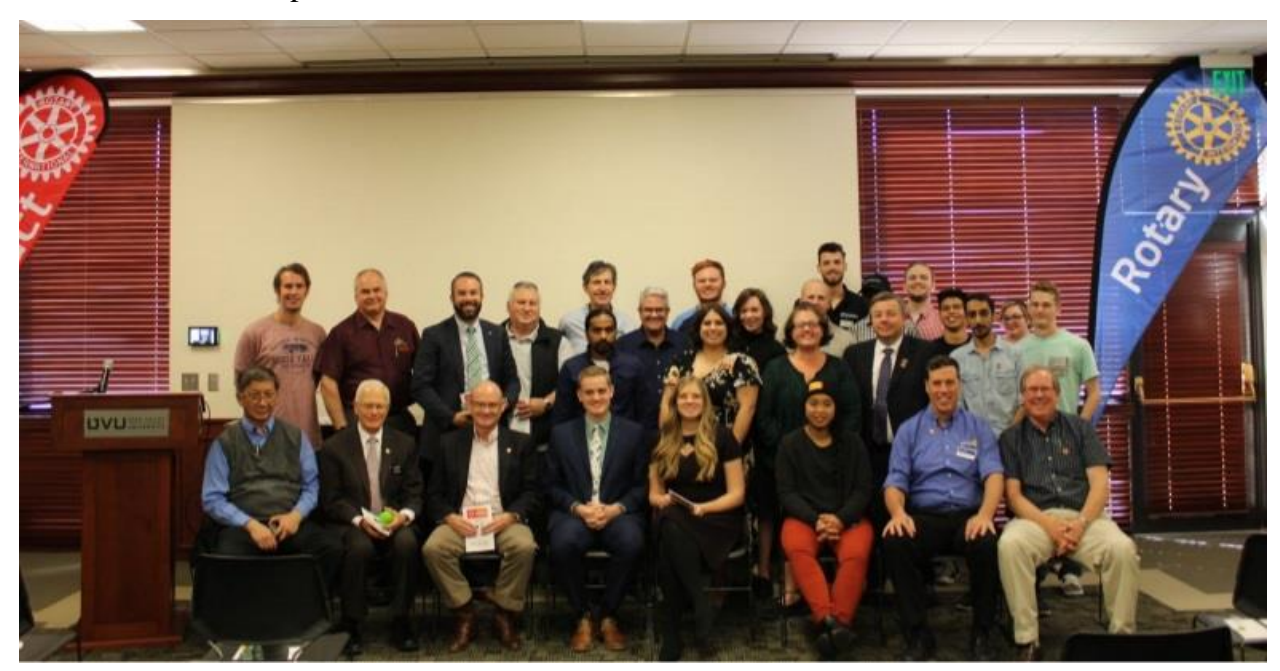
UVU World Polio Day Event at UVU

It was informative and moving to hear the stories of the long-time membership of the Rotary members, and the influence it has had in their lives as they've been able to participate in service and fellowship with those around them.