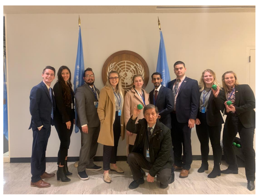
Myself and fellow colleagues in UN headquarters.