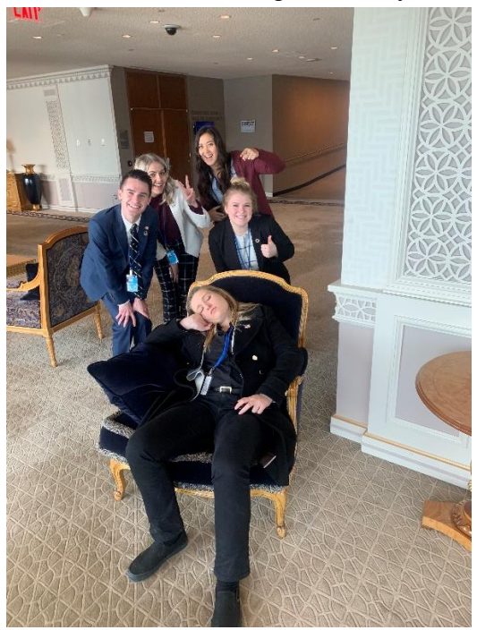
The view of Long Island from the delegate lounge. Other UIMF members and I in the delegate lounge.

It goes without saying that lots of hard work, long nights, and perseverance got our delegation to the United Nations. That coupled with the overnight traveling the day before and the preparations before the final hour made the lounge the perfect place for me to mentally center myself through meditation. I was thankful for the space to join many other delegates from around the world as we used the quiet and secluded space for activities such as meditation, negotiations, and napping between battles for gender equality at both the official and unofficial levels.