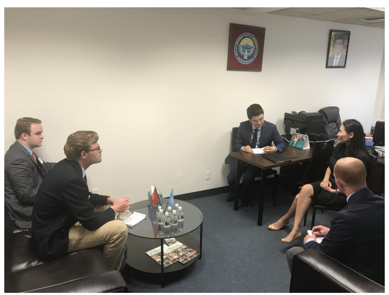
UIMF delegation discussing the SMD agenda at the Kyrgyz Permanent Mission

countries all adopted a resolution which acknowledges the need to preserve the snow leopard's habitat, which is often times mountainous. These nations will continue to support ecosystem preservation and restoration to stabilize and preserve the snow leopard population. This resolution will impact the SMD agenda by preserving mountain environments in Asia, which are vital to ecosystems across the continent.