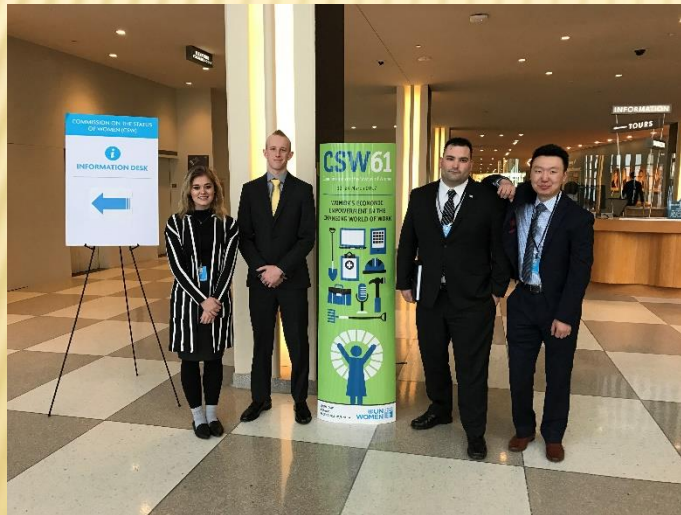
UIMF members at the 61 st session of the UN Commission on the Status of Women, New York, March 22, 2017