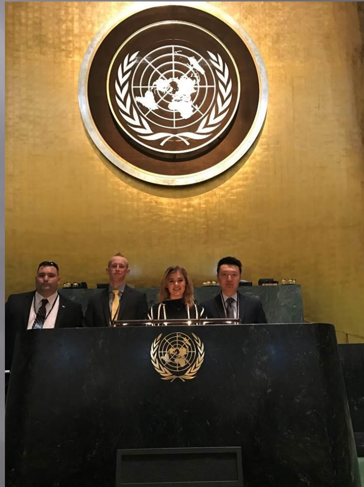
The UIMF Members at the podium of the UN General Assembly