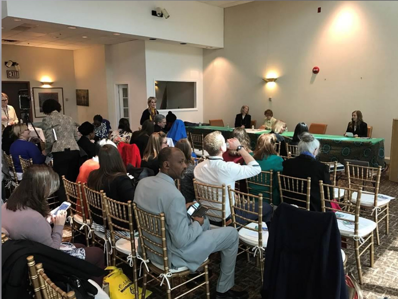
The Utah Delegation at a side event at the Nigerian Mission to the UN