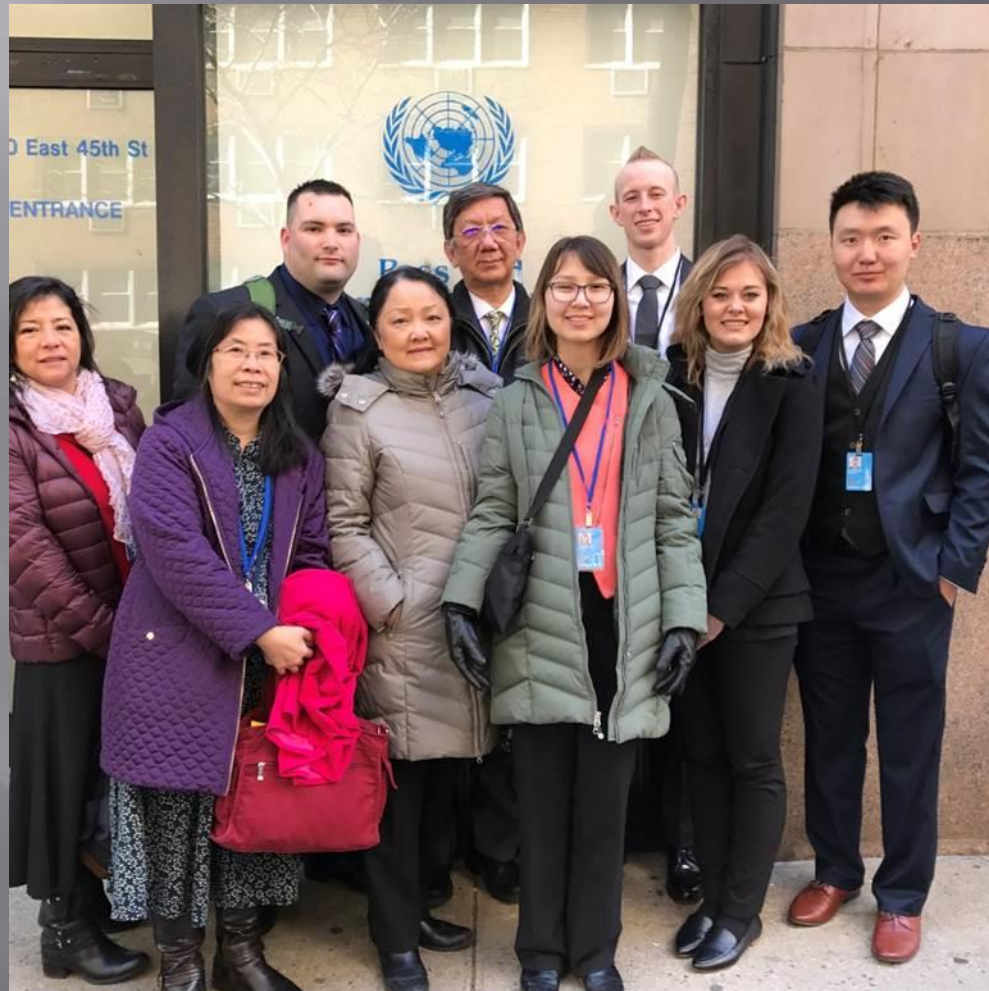
After Getting UN Passes