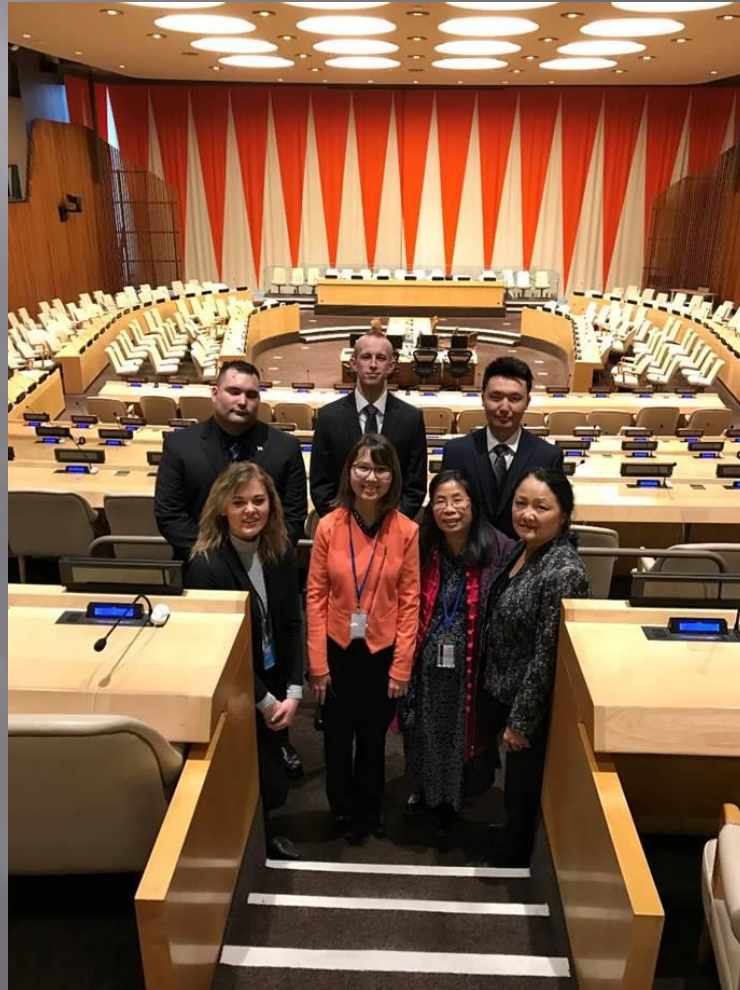
The UVU Delegation at ECOSOC Chamber