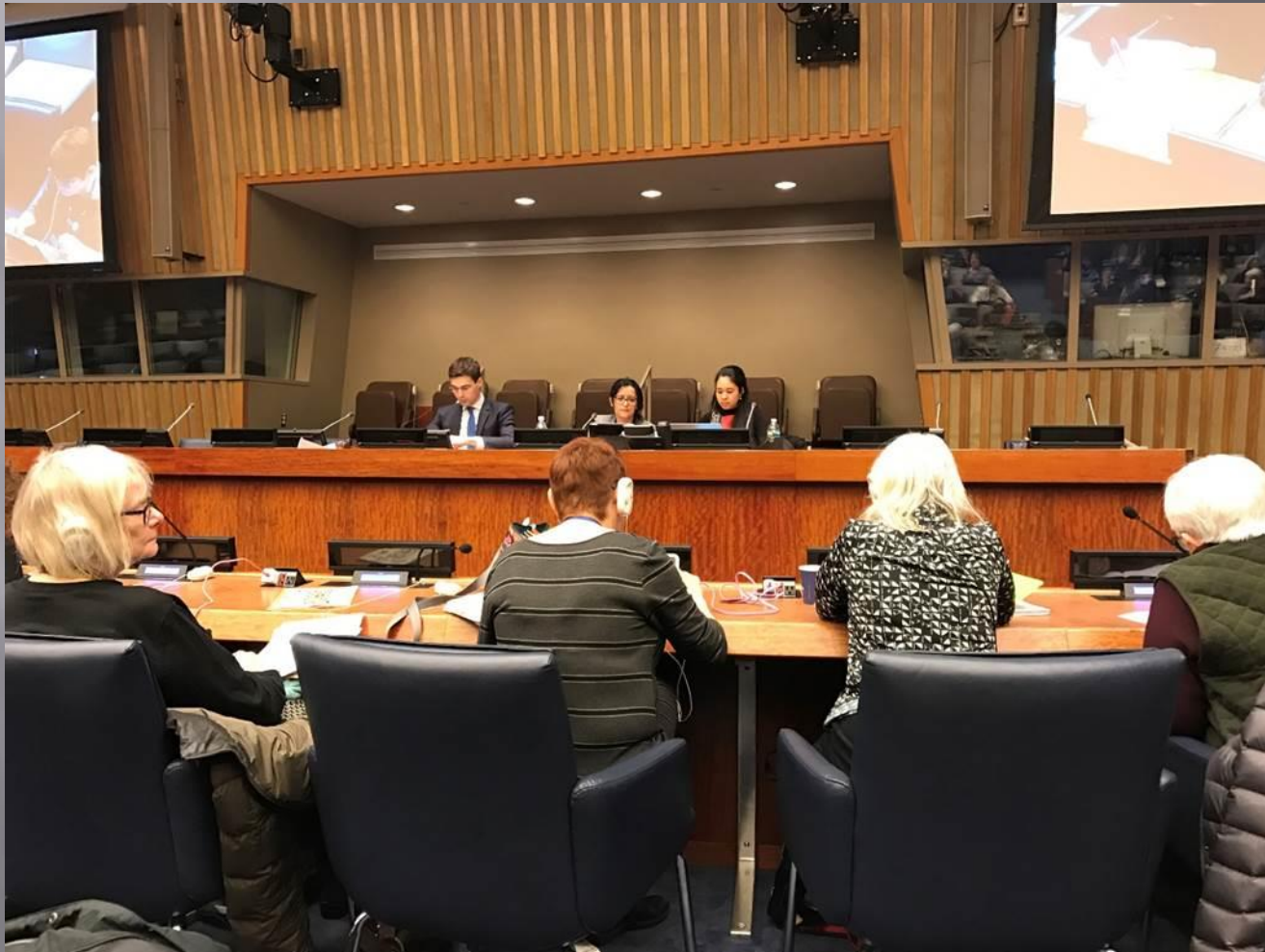
The meeting of CSW61 NGOs to discuss the final document of the event