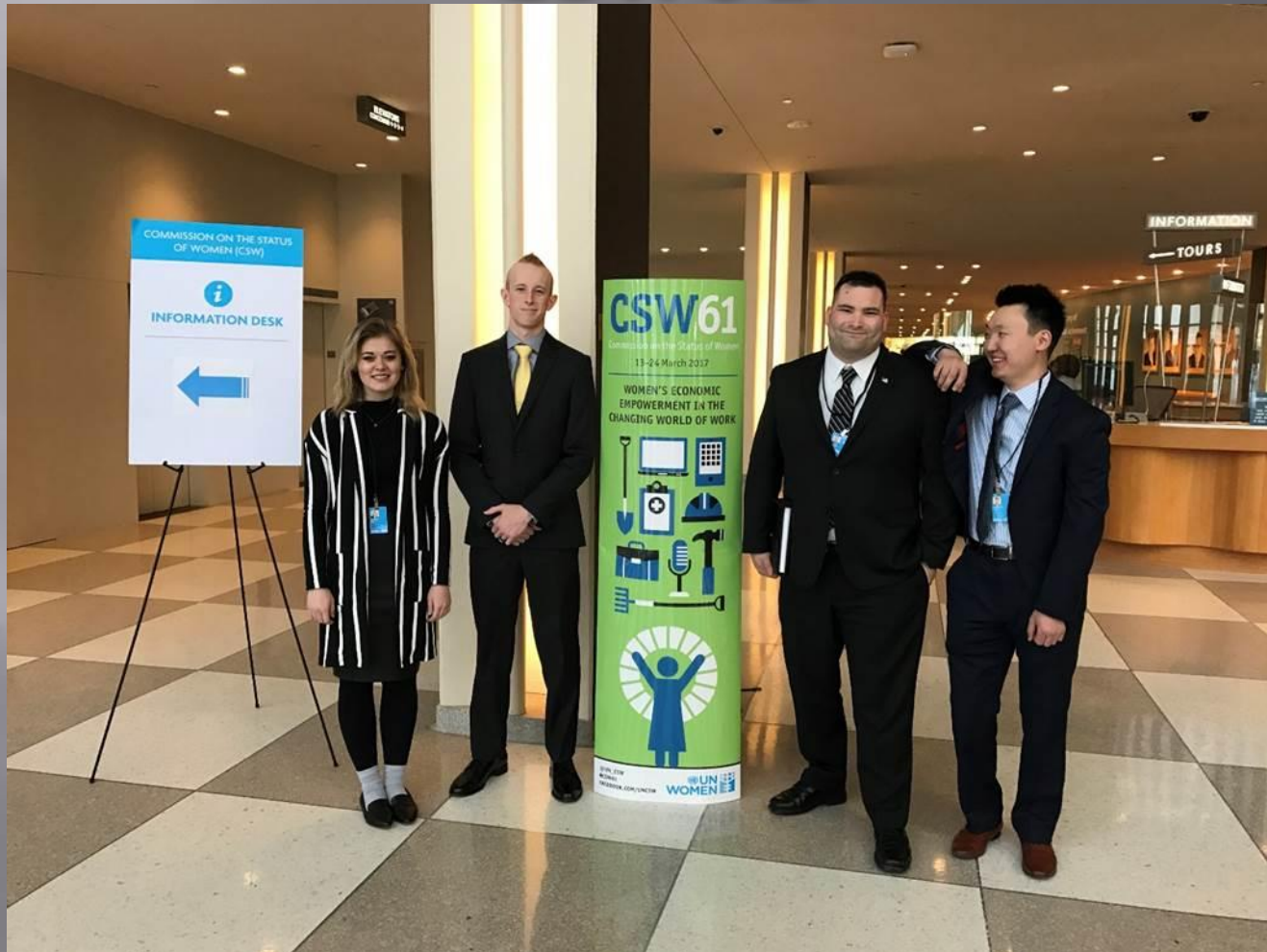
The UIMF members at CSW61 at the UN Headquarters