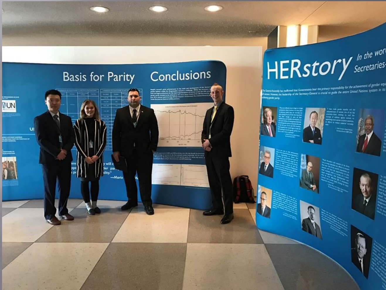
The UIMF Members at CSW61 Exhibition