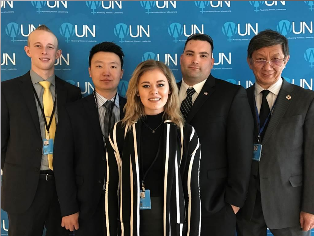
The UVU Delegation at CSW61 at the UN Headquarters