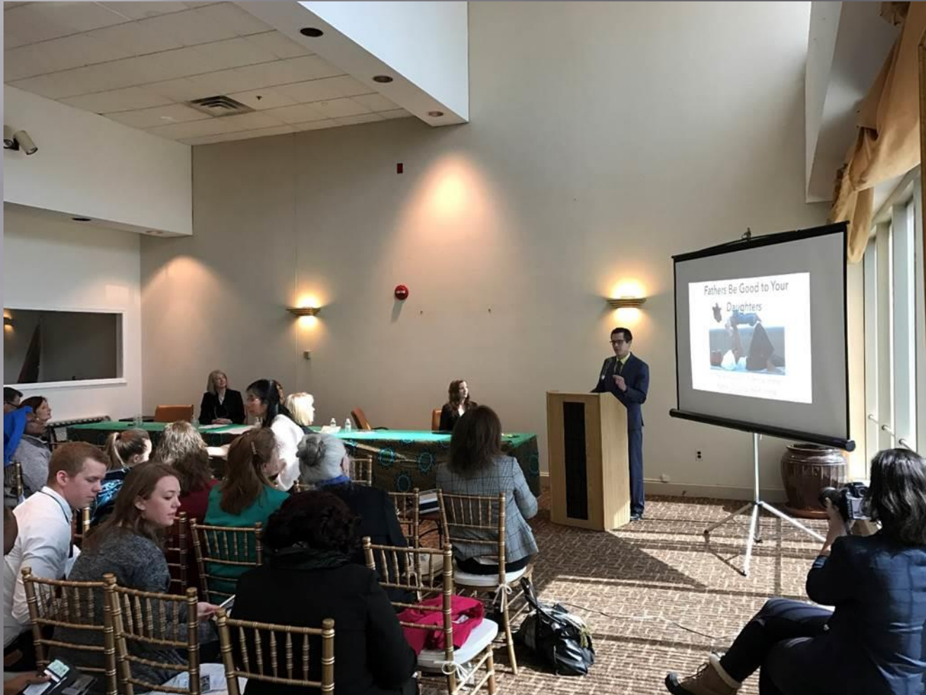
The Utah Delegation at a side event at the Nigerian Mission to the UN