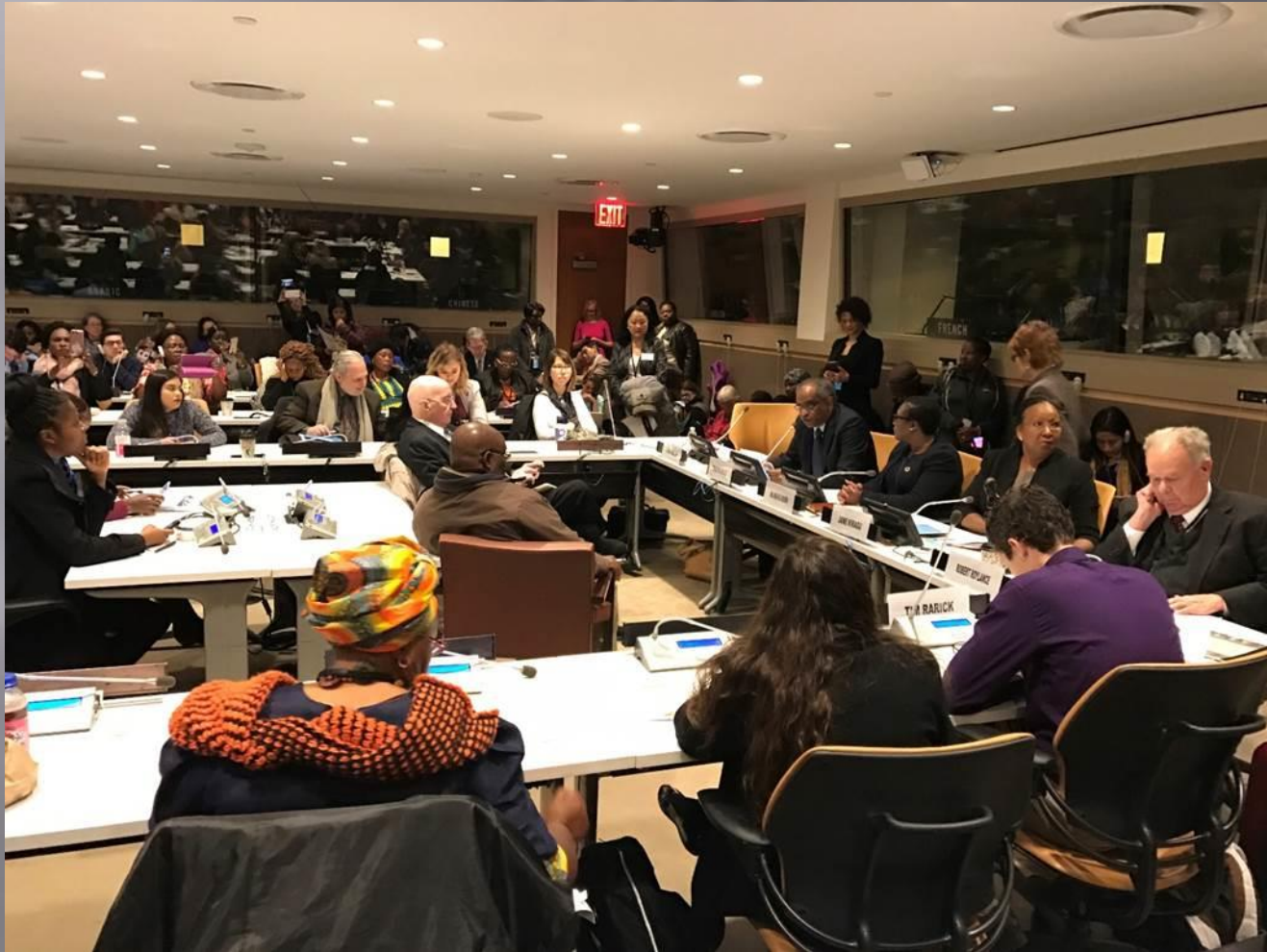
The UVU Delegation at a side event sponsored by the Kenyan Mission to the UN