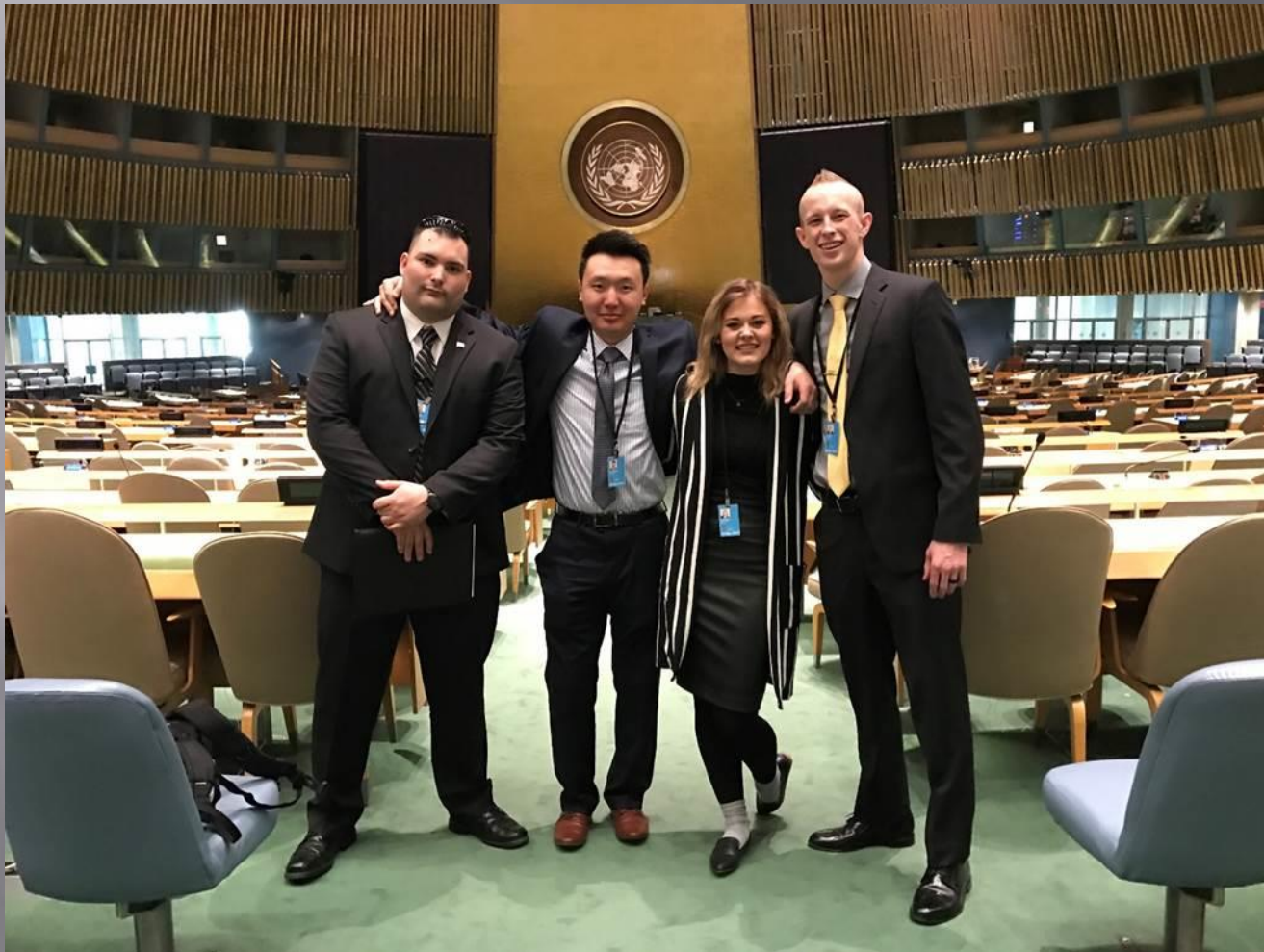
The UIMF Members in the hall of the UN General Assembly