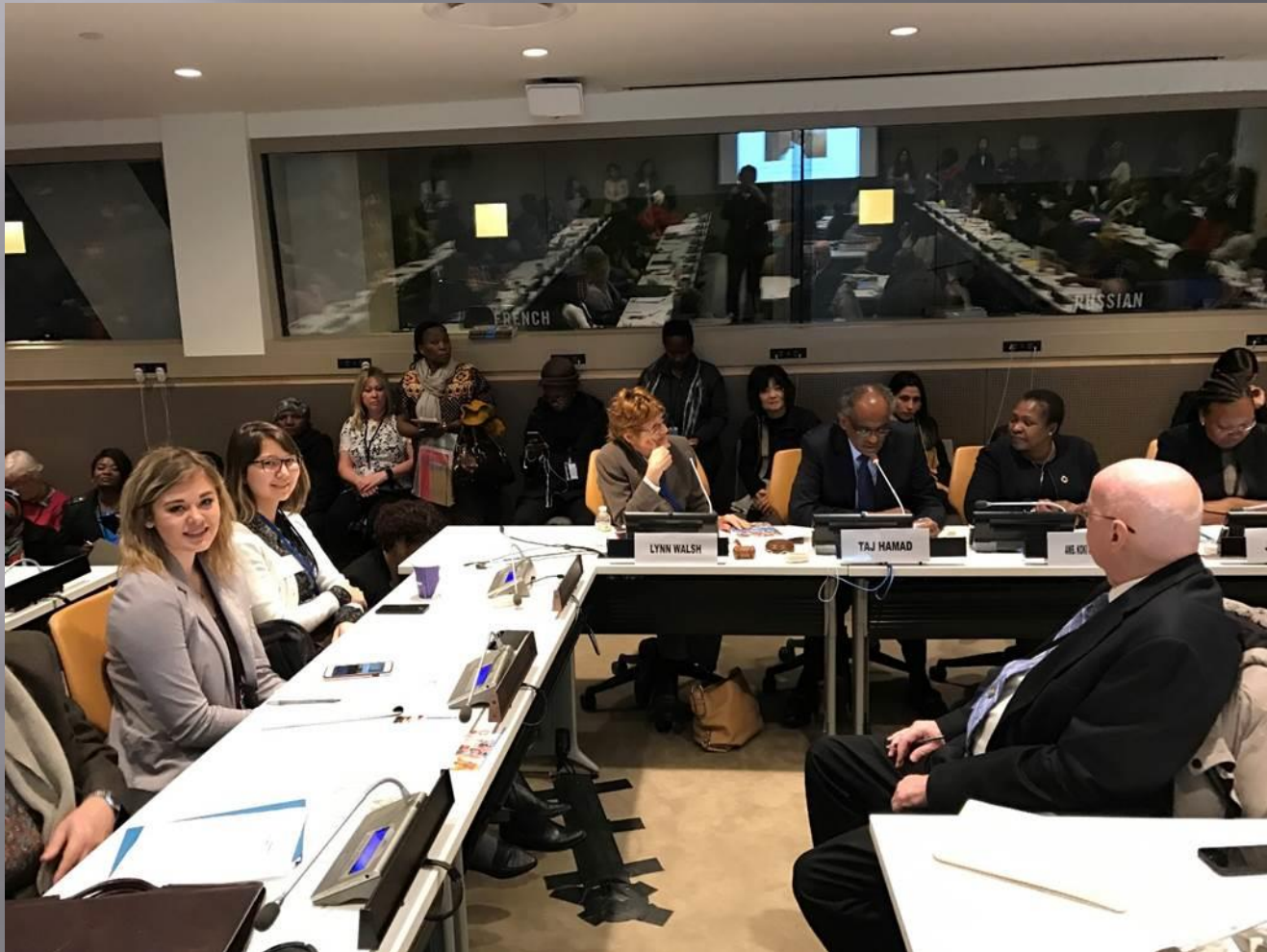
The UVU Delegation at a side event sponsored by the Kenyan Mission to the UN