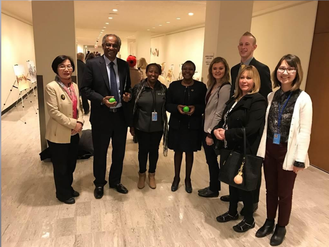
The UVU Delegation with the DCM of Kenya to the UN after a side event