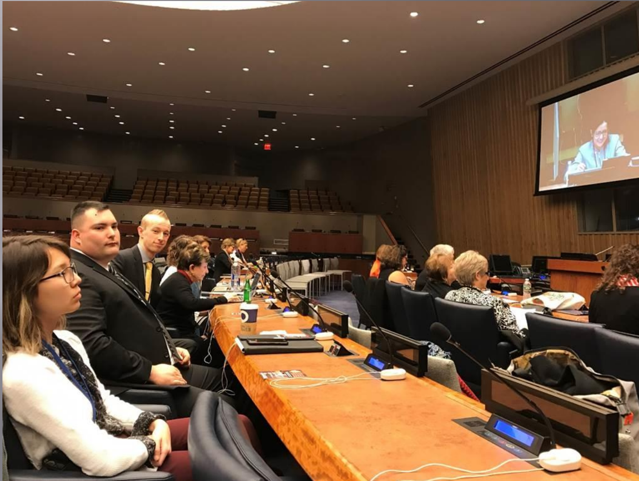
The UVU Delegation during the informal meeting of NGOs at CSW61