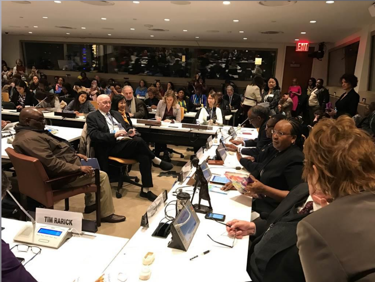
The UVU Delegation at a side event sponsored by the Kenyan Mission to the UN