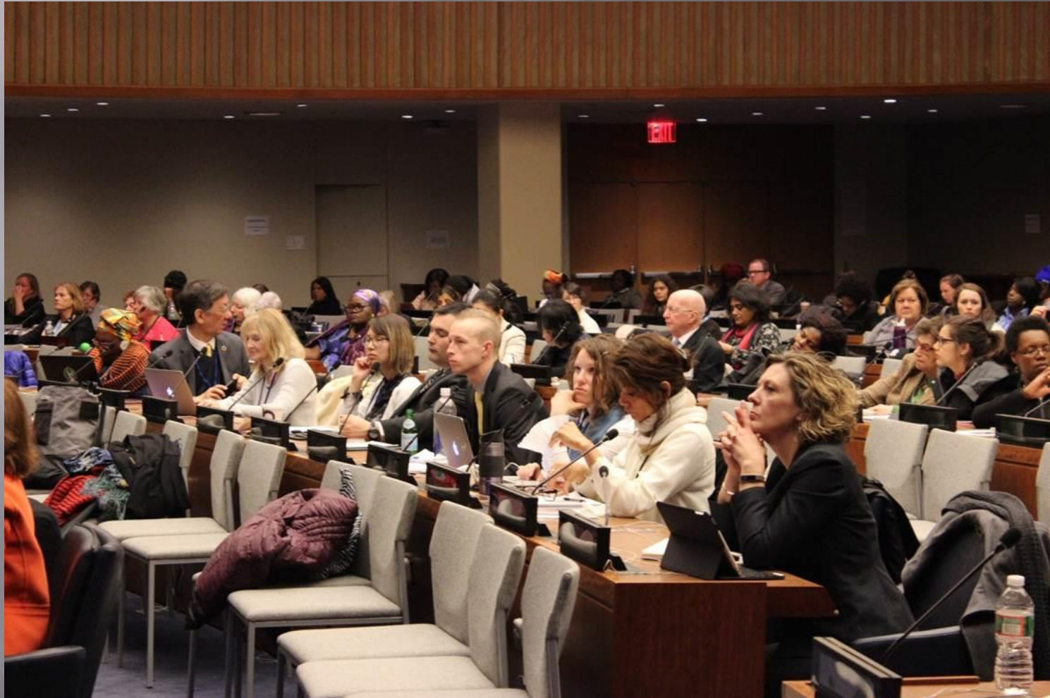
The UVU Delegation during the informal meeting of NGOs at CSW61