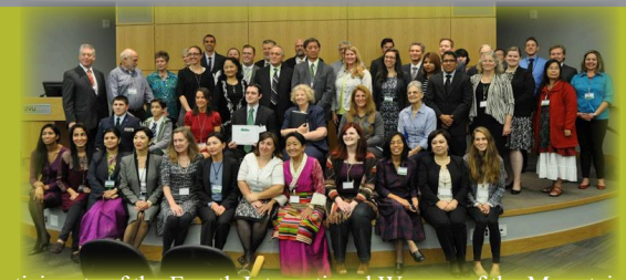
Participants of the Fourth International Women of the Mountains Conference held October 7-9, 2015 in Orem, UT

• For the first time, UIMF students hosted and organized the Fourth International Women of the Mountains Conference under the umbrella of the Mountain Partnership affiliated to the Food and Agriculture Organization of the UN