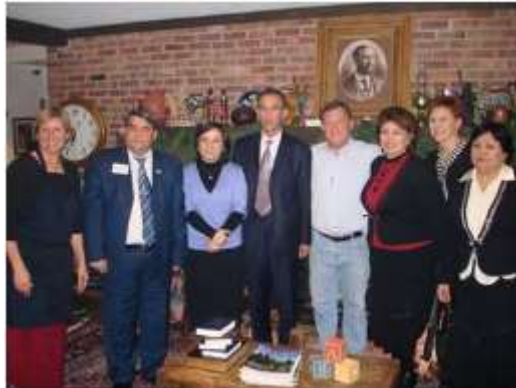
Members of the Tajik Parliament at a meeting with U.S. Congressman, Chris Cannon, at his Utah home during the Thanksgiving holiday.