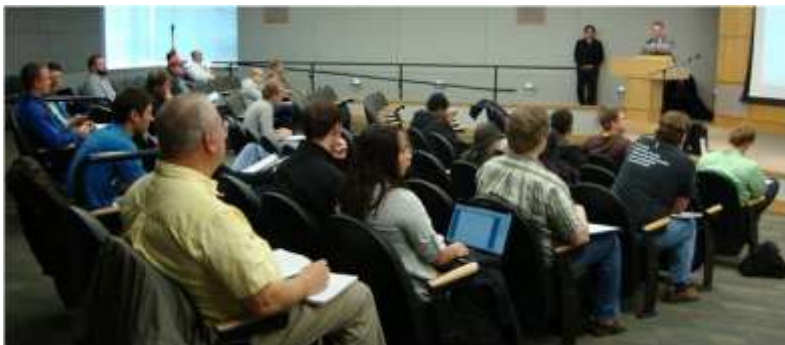
Faculty and students during celebration of the International Mountain Day at UVU