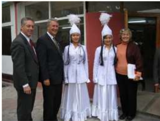
Rocky Mountains delegation in Kyrgyzstan before signing a MOU with the Kyrgyz State University