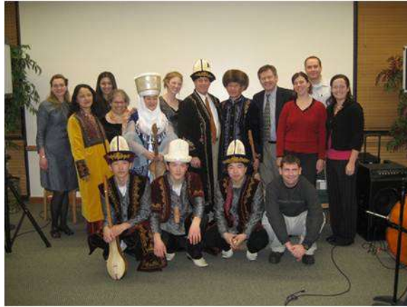
Folk Music group “Kut” from Kyrgyzstan at UVU during their tour of the Rocky Mountains states