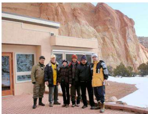
Turkmen Professional Delegation at UVU Capitol Reef Field Station