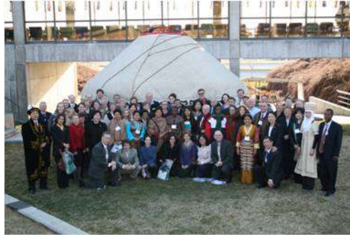
Participants of the International Conference “Women of the Mountains” during the presentation of the Kyrgyz yurt at the UVU (March 7-10, 2007)