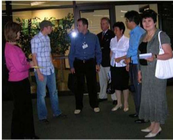
Kyrgyz Librarians at Utah Valley University

acquainted with some of the State's attractions. In addition, homestays with local residents allowed the delegates to experience Utah family life.