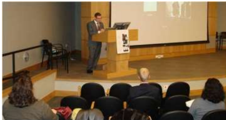
During the video-conference