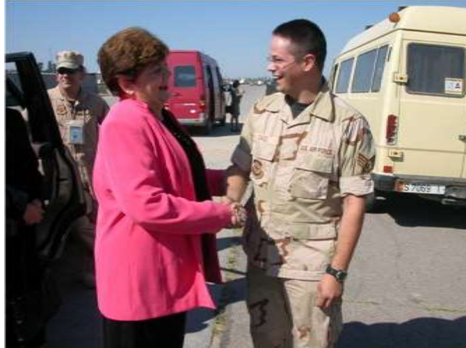
Utah Governor Olene Walker with military personnel from Utah at military base Gansi (airport Manas) in Kyrgyzstan on August 23, 2003