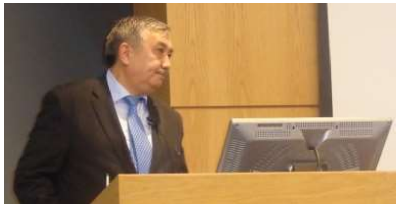
H.E. Talaybek Kydyrov, the permanent representative of the Kyrgyz Republic to the United Nations during the conference at UVU