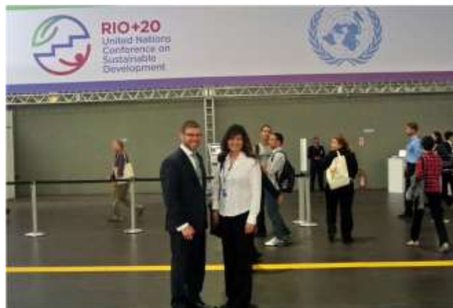
UVU delegation in Brazil during the U.N. Conference on sustainable development