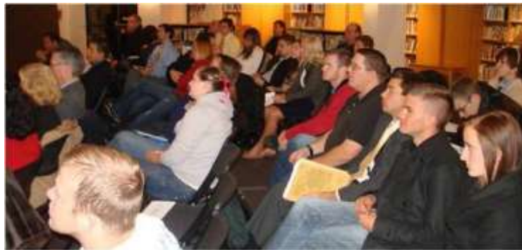
During the celebration of International Mountain Day 2011