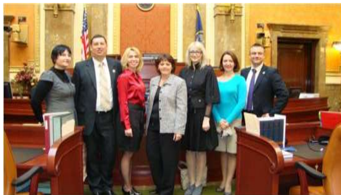
Library of Congress/ UVU Ukrainian delegation of educators at Utah State Senate