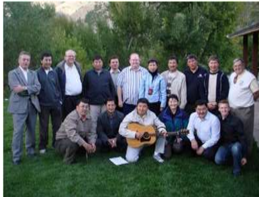
A delegation of Kyrgyz judges visiting Utah