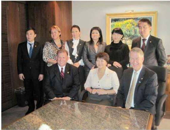
Library of Congress/UVU Kazakh Judges Delegation with Senators Valentine and Bramble