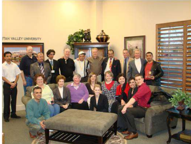
The Tajik delegates during their farewell reception at UVU