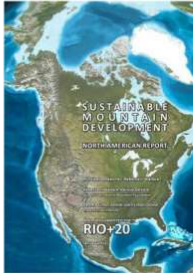
Copy of the report on sustainable mountain development on North America for the RIO+20 U.N. Conference on sustainable development in Brazil

Concert from Orem and a fashion show of UVU student models, representing different mountain nations.