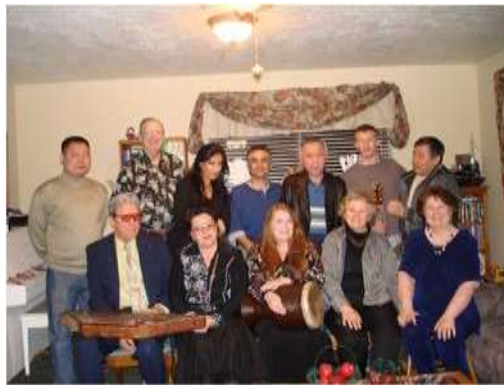
Members of the Kyrgyz delegation during a reception in Orem, Utah