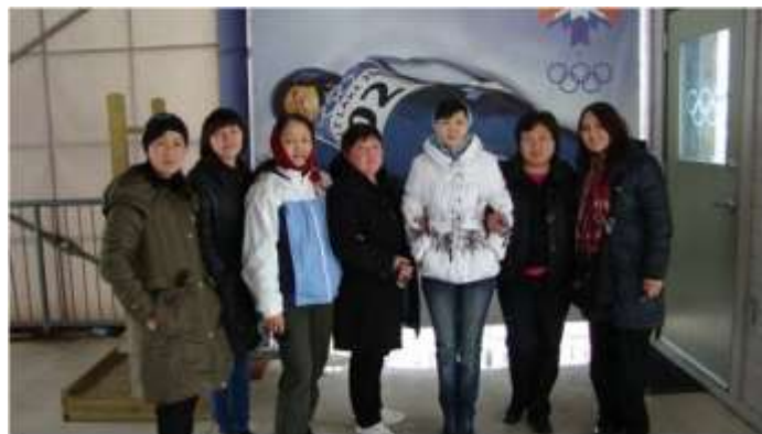
Kyrgyz women delegation at Park City in Utah