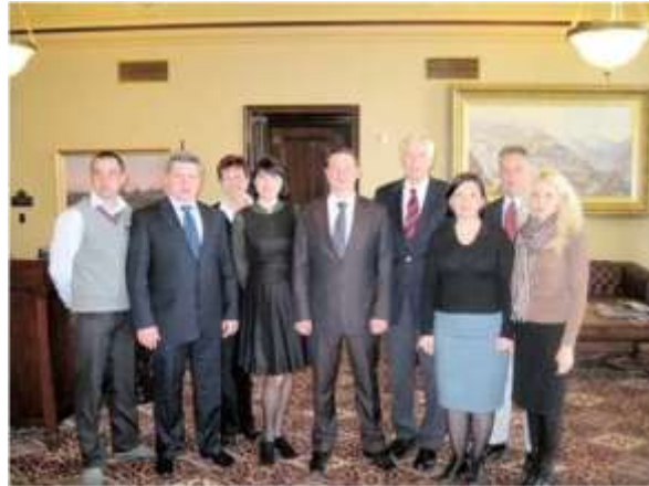
Library of Congress/UVU Ukraine Delegation with Utah Lt. Governor Bell

U.S. counterparts and experience American-style democracy at a local level. From Feb. 26- March 6 the delegates examined Utah's eco-tourism industry. During their stay the delegates met with Sundance's Green Team, visited Arches National Park and UVU's Capitol Reef Field Station, and held a workshop at the State Tourism Office and University of Utah's Department of Parks, Recreation and Tourism. Delegates also met with the local, state and federal government officials, including U.S. Senator Bennett and U.S. Congressman Jason Chaffetz.