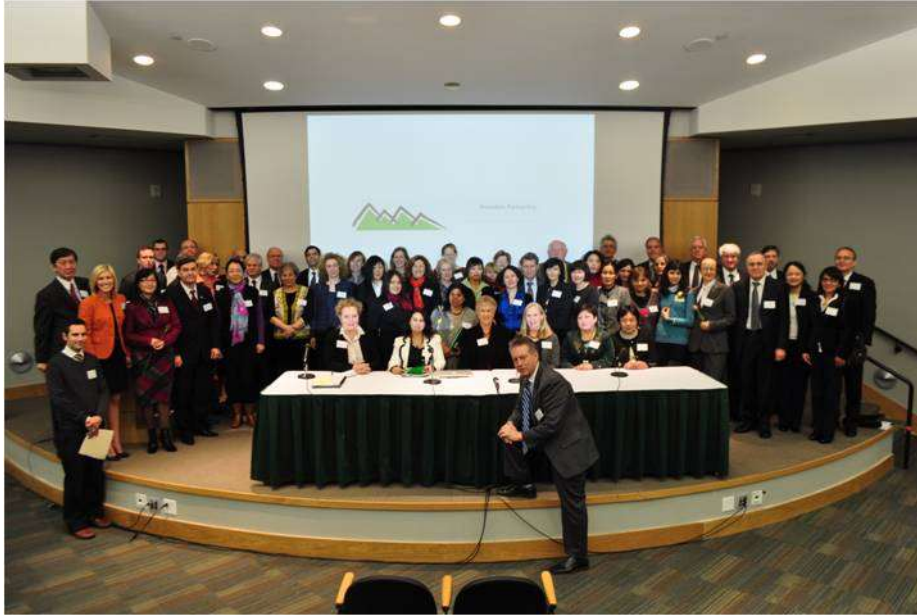
Participants of the second International Conference “Women of the Mountains” at UVU (March 7-9, 2011)