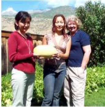
Kyrgyz students helped grow the first Ko'on melon in Utah from Kyrgyz seeds