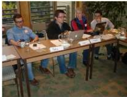
UVU students, members of Utah delegation during negotiations in Aspen