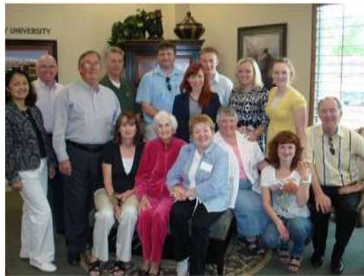
Russian delegation during reception