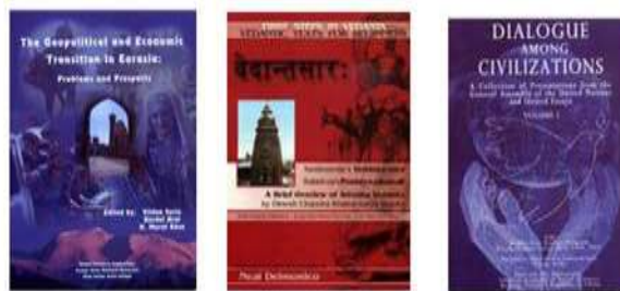
Some book samples, published within the Eurasian series by UVSC and Global Scholarly Publications during 2003-2007