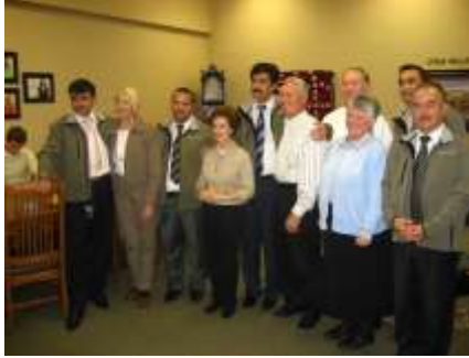
Members of the 2008 Tajik delegation with the Utah host families