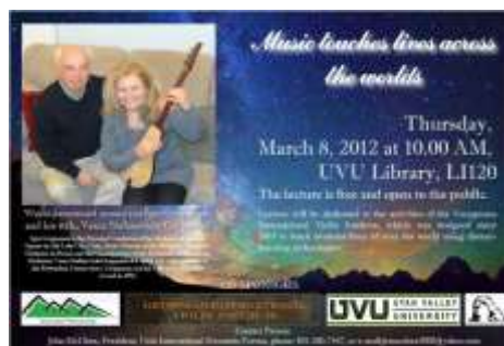
Poster about presentation of Igor and Vesna Gruppman at UVU