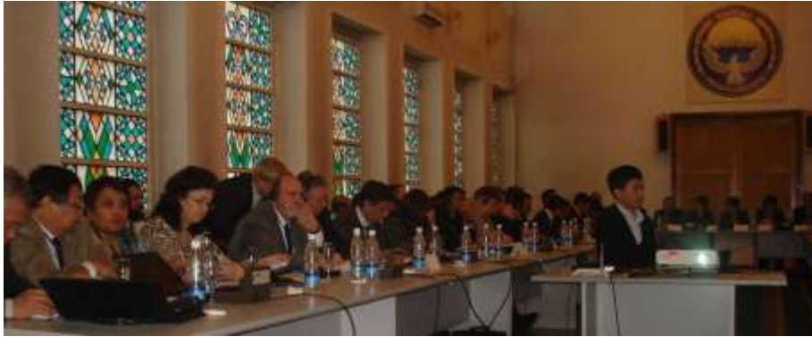
UVU delegation during the international conference Mountains and Climate in Kyrgyzstan

contributing research to the North American Report on SMD for the RIO+20 summit, and other efforts to advocate the SMD-agenda both in the region and globally. The celebration was attended by nearly 100 people, including community members, a variety of local government leaders, and other MP members such as Gruppman International Music Institute, Hope International, Orem City, Provo City, Utah Valley University, and the Utah-Russia-Institute.