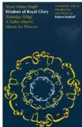
Wisdom of Royal Glory (Kutadgu Bilig), published by the University of Chicago Press in 1983 and reprinted by Utah Valley University in 2009