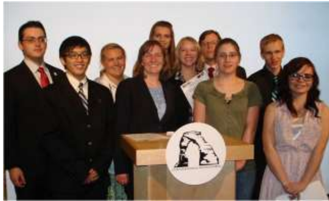
Winners of the contest and organizers of the workshop