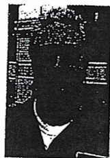
By Chase N. Sargent

This book offers up one of the most amazing success stories I've ever read. You think you've got it tough with the young members we're hiring today? Try going to war on a ship with crewmembers no more than 18 or 19 years old, and none of them have ever been away from home. Screwing up on the fireground is one thing, but putting a cruise missile in the wrong location is an entirely different issue. This is a must-read for you young officers. ▶