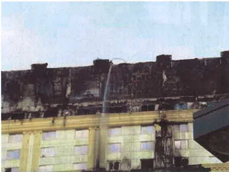
(6) Roof operations.

This structure was on the approach path for a heliport, which created another issue for roof operations (photo 6). This downwash created a safety issue as the helicopters buffeted the firefighters and increased the amount of falling debris. Through the Las Vegas Metropolitan Police (MPD) and the McCarran International Airport air control, these distractions were eventually prohibited within one mile of the resort. Other issues were created by the flaming debris, which started several spot fires on adjacent roofs.