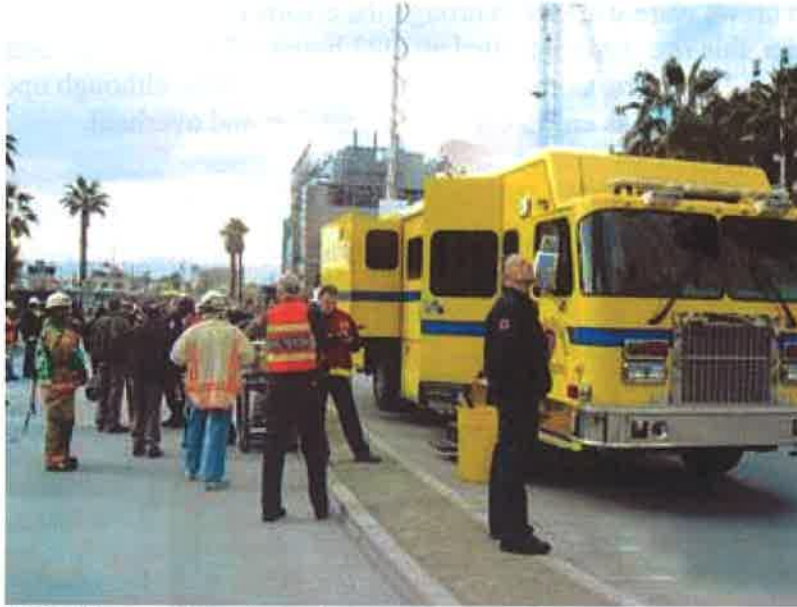
(9) Unified command.