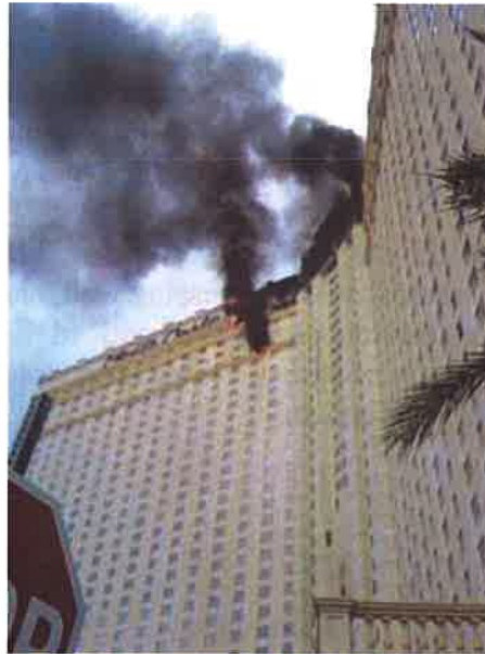
(2) The fire from ground level.

Engine 11 (E11) arrived at 1100 hours and confirmed that there was definitely a fire and that it appeared to be on the exterior of the structure (photo 2). E11 requested a second alarm, duplicating the first alarm. B2, on hearing the report and seeing the smoke rising from the strip, ordered a third alarm at 1101 hours. [Photo 3 shows the view from the A side (Las Vegas Boulevard) of the structure.]