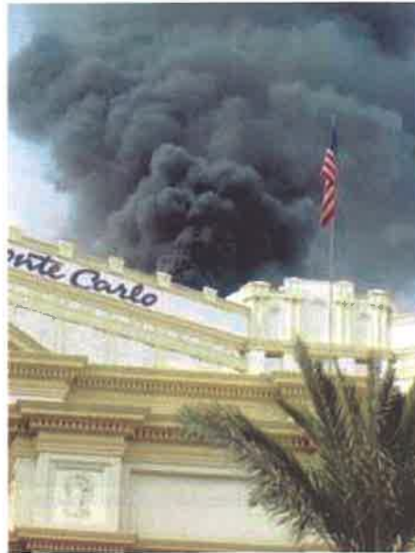
(3) The view from Las Vegas Boulevard.