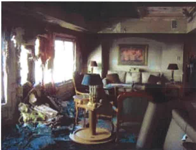
(7) Fire breached the structure.

As a result of the MGM fire in 1980 and the Hilton fire in 1981, Nevada has some of the toughest high-rise fire safety regulations in the country. These life safety systems paid off at the Monte Carlo fire. Despite fire gaining access to the structure at two levels, sprinkler systems activated and kept the fire in check until suppressions crews could gain access (photo 7) and suppress the fire (several heads operated on the 27th and 32nd floors). Sprinklers assisted interior crews, and the focus changed to extinguishing the exterior area. Crews on several floors forced windows and attacked from these vantage points. The problem was locating a window that would not allow extension into the structure but would provide a good point from which to extinguish this fire. Then, there was the concern for placing a firefighter halfway out a window 29 floors aboveground. Several firefighters were secured with safety lines while operating from the roof over the side of the building.