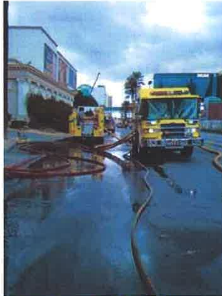
(8) Tandem pumping at 340 psi.

areas in which crews were working. Through the efforts of more than 120 personnel staffing 63 units, this fire was controlled at 1223 hours—1 hour and 25 minutes after the initial alarm. By 1317 hours, Command began releasing units, although operations would continue for several hours as crews completed searches and overhaul.