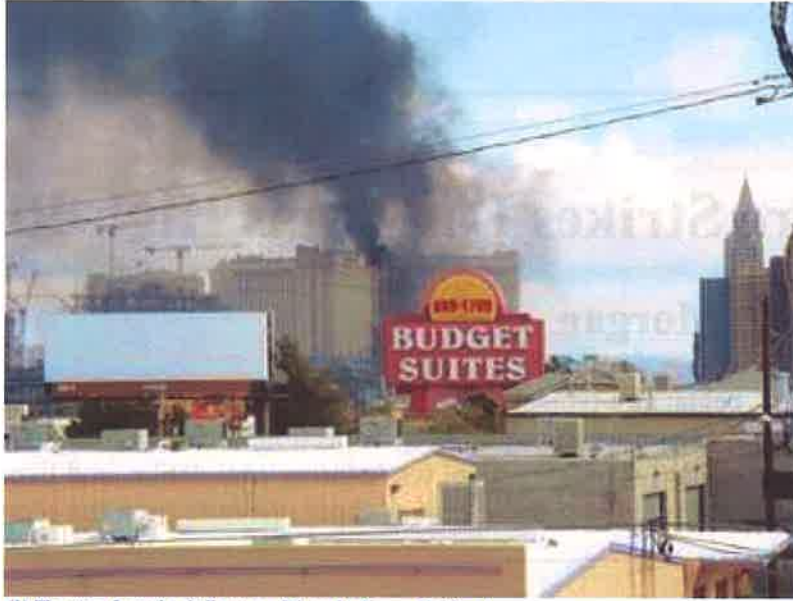
(1) The view from the drill tower.