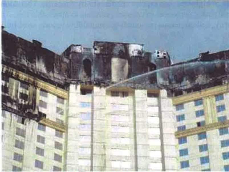
(5) A large-caliber stream from the 29th floor.