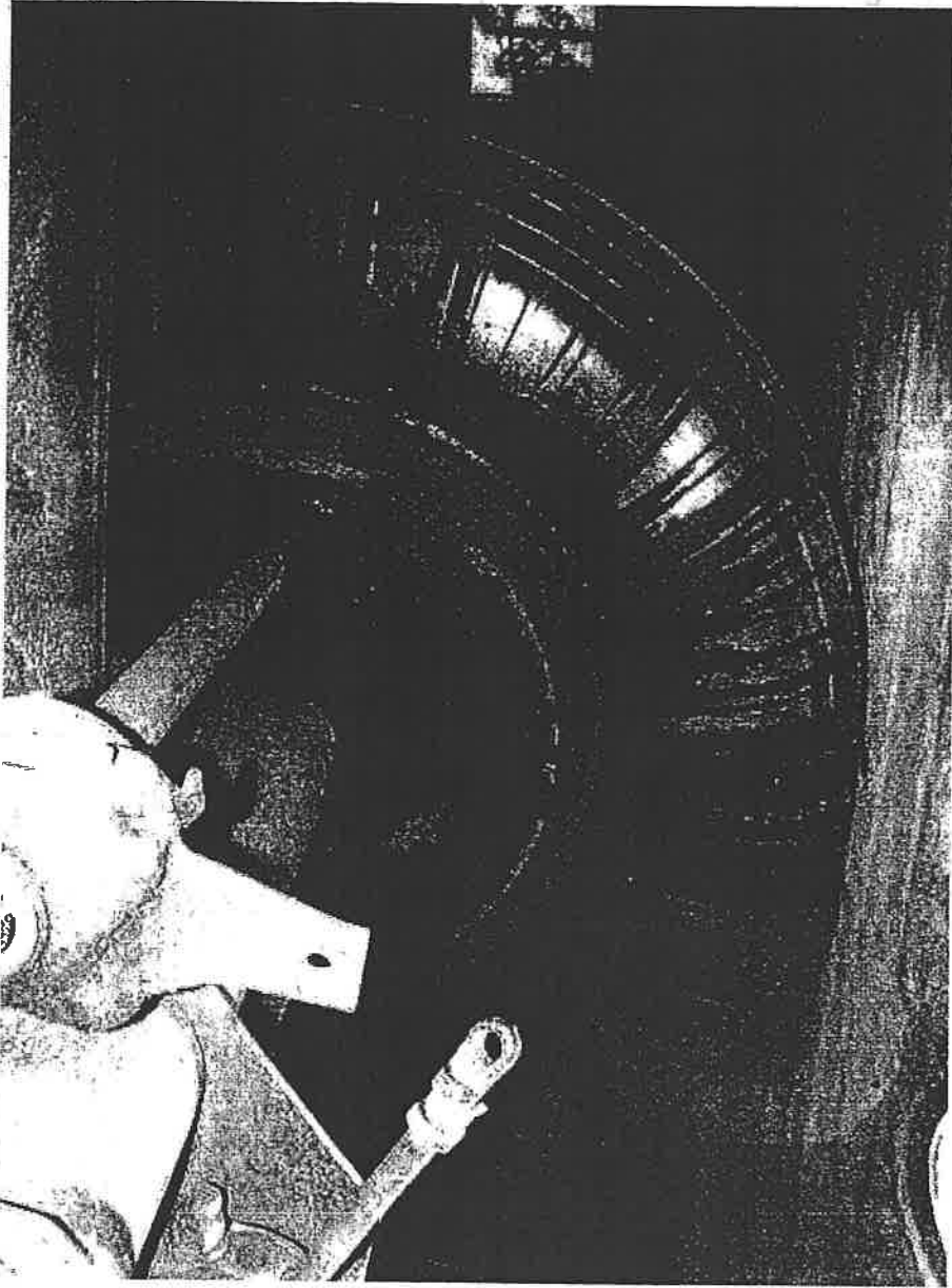
A drive axle that has a blown oil seal and the driver disconnected the push-rod from the slack adjuster so the brake would not operate or catch on fire.