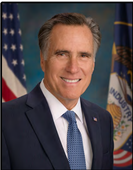
Senator Mitt Romney State of Utah