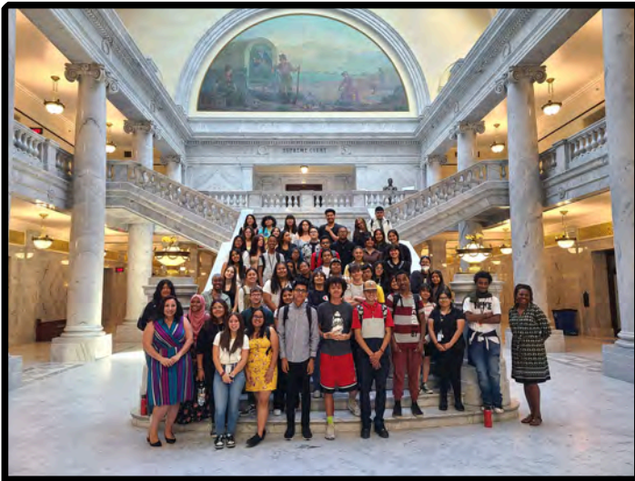
University of Utah TRIO Upward Bound students visit the Utah State Capitol.