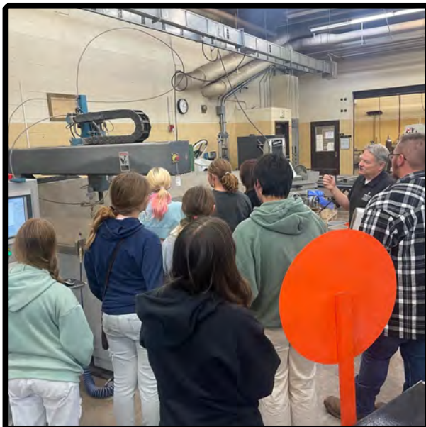
Utah State University (Price Campus) TRIO Upward Bound students attend an on-site career exploration tour and workshop.