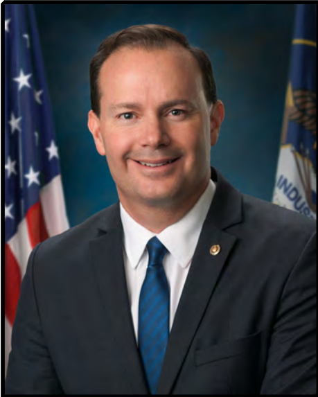
Senator Mike Lee State of Utah