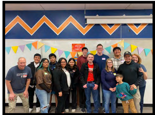
Snow College TRIO Upward Bound students attend a local career fair.