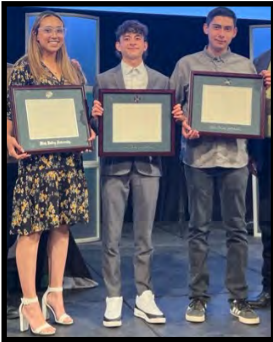
Utah Valley University TRIO Upward Bound students graduate with their associate degrees at time of high school graduation (June 2022).