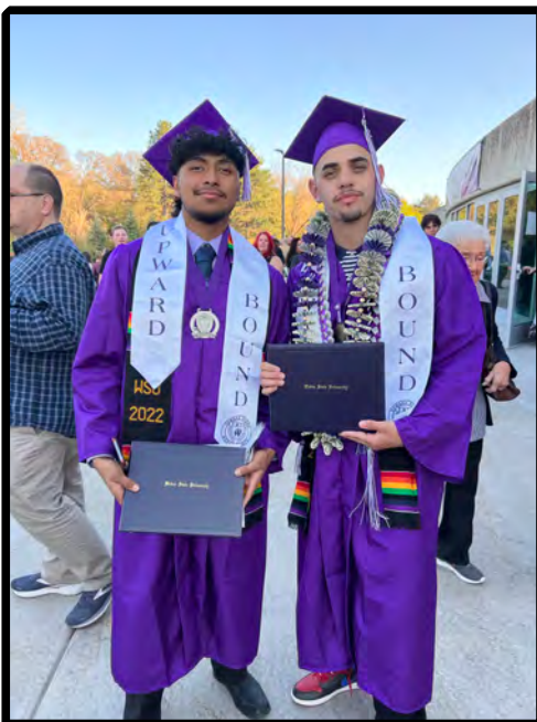
Weber State University TRIO Upward Bound graduates complete their associate degrees (May 2022).