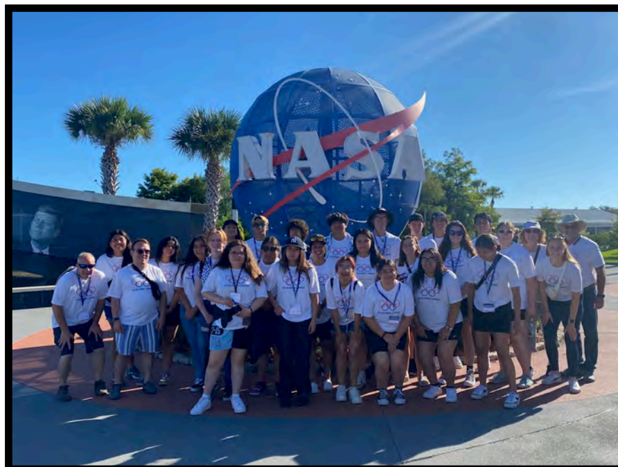
Snow College TRIO Upward Bound students on a tour of NASA's Kennedy Space Center near Orlando, Florida.