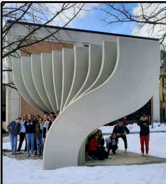
Southern Utah University TRIO Talent Search 9th graders tour Brigham Young University.