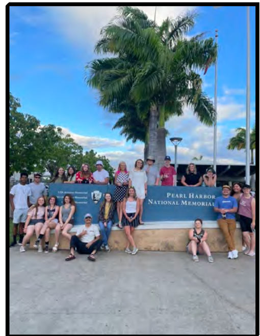
Utah State University (Price Campus) TRIO Upward Bound students at Pearl Harbor National Memorial.