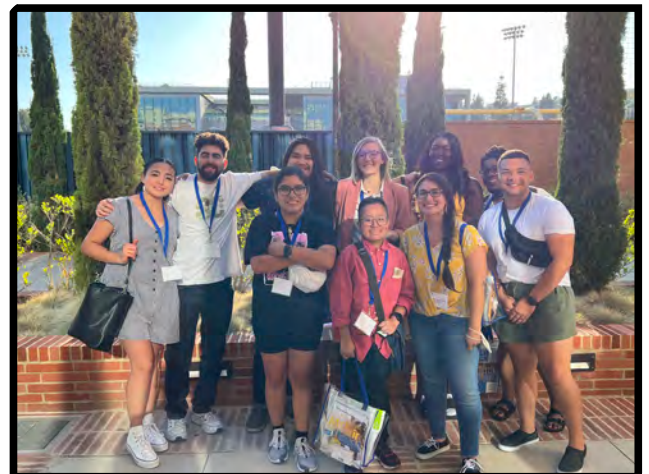
Westminister College McNair scholars at UCLA's McNair conference (July 2022).