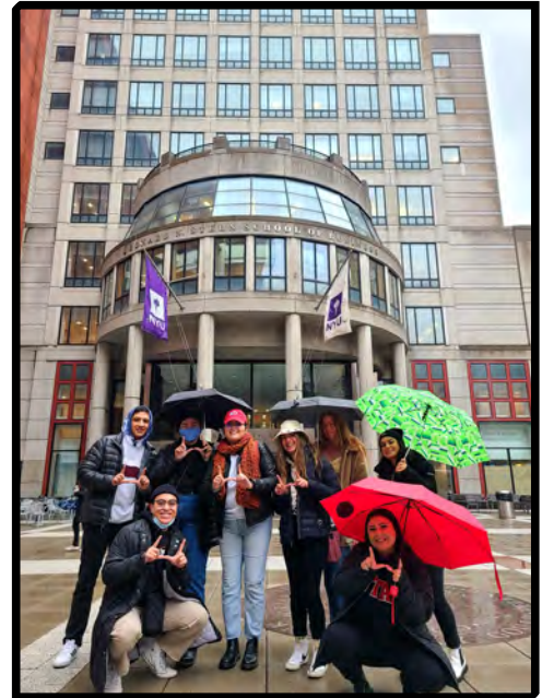
University of Utah TRIO Student Support Services students on a graduate school tour at NYU.