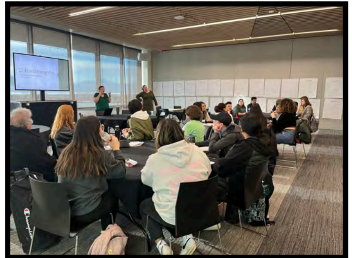
Utah Valley University TRIO college students attend a Clifton Strengths workshop.