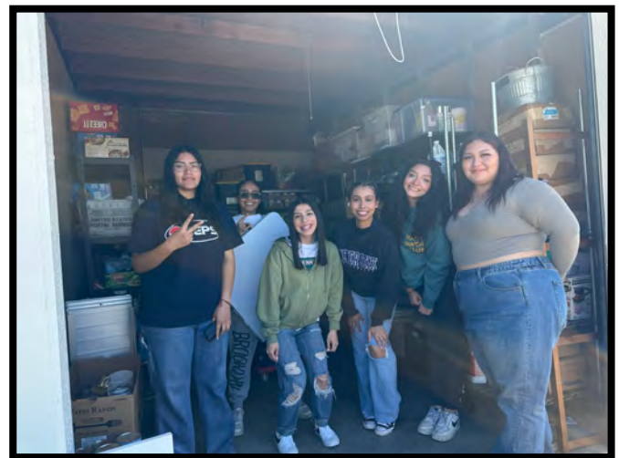
Weber State University TRIO Student Support Services students participate in service projects during Spring Break in San Diego, CA.