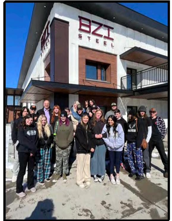
Southern Utah University TRIO Talent Search students tour BZI Steel for career exploration.