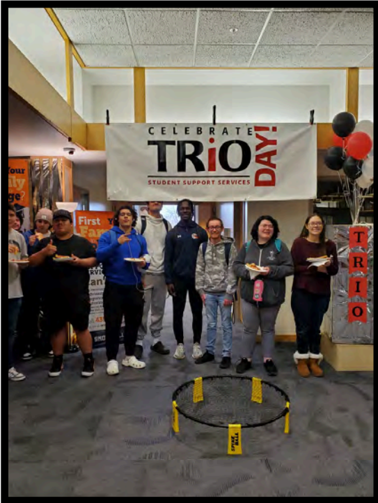
Snow College TRIO Student Support Services students celebrate National TRIO Day.