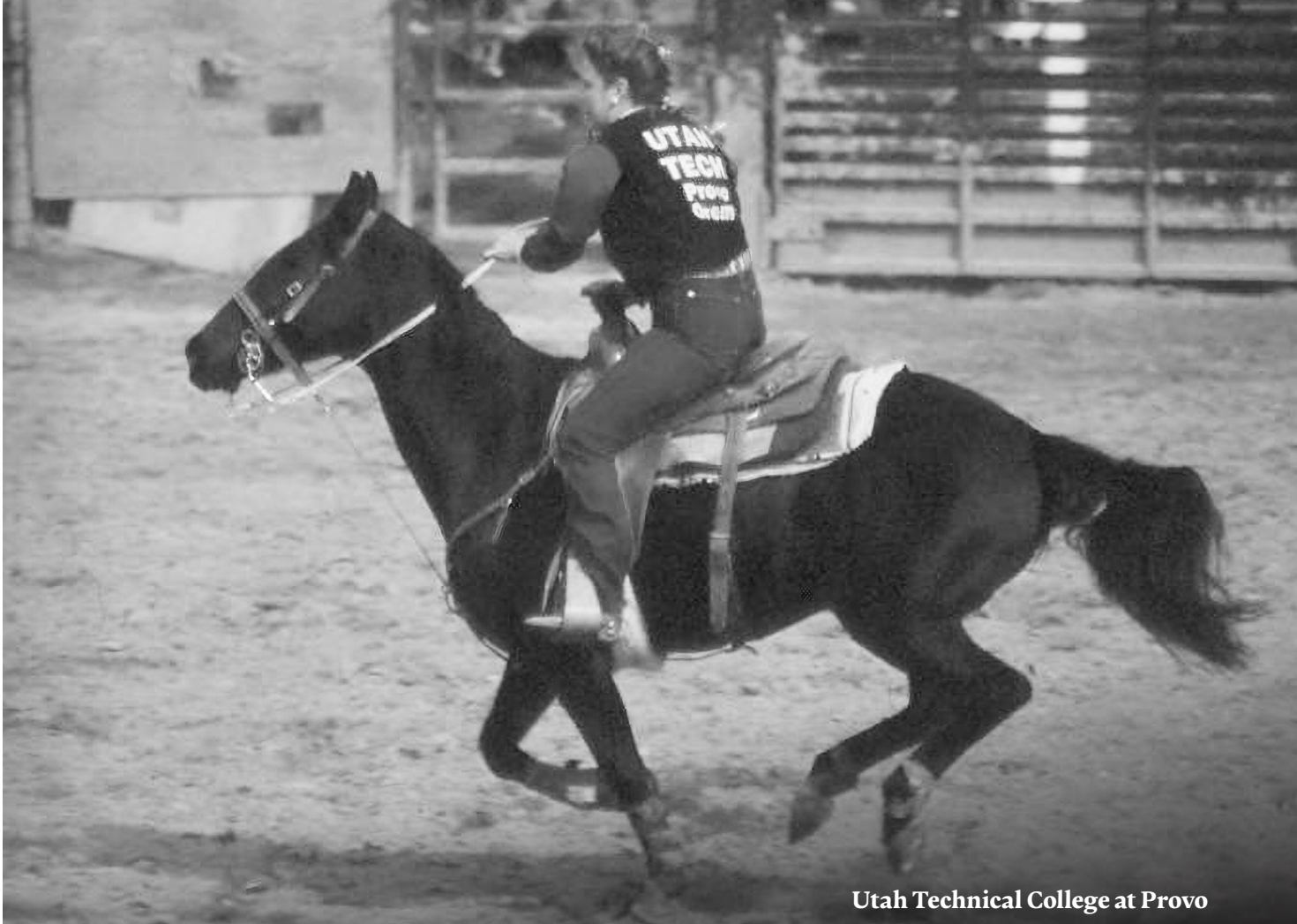
Utah Technical College at Provo