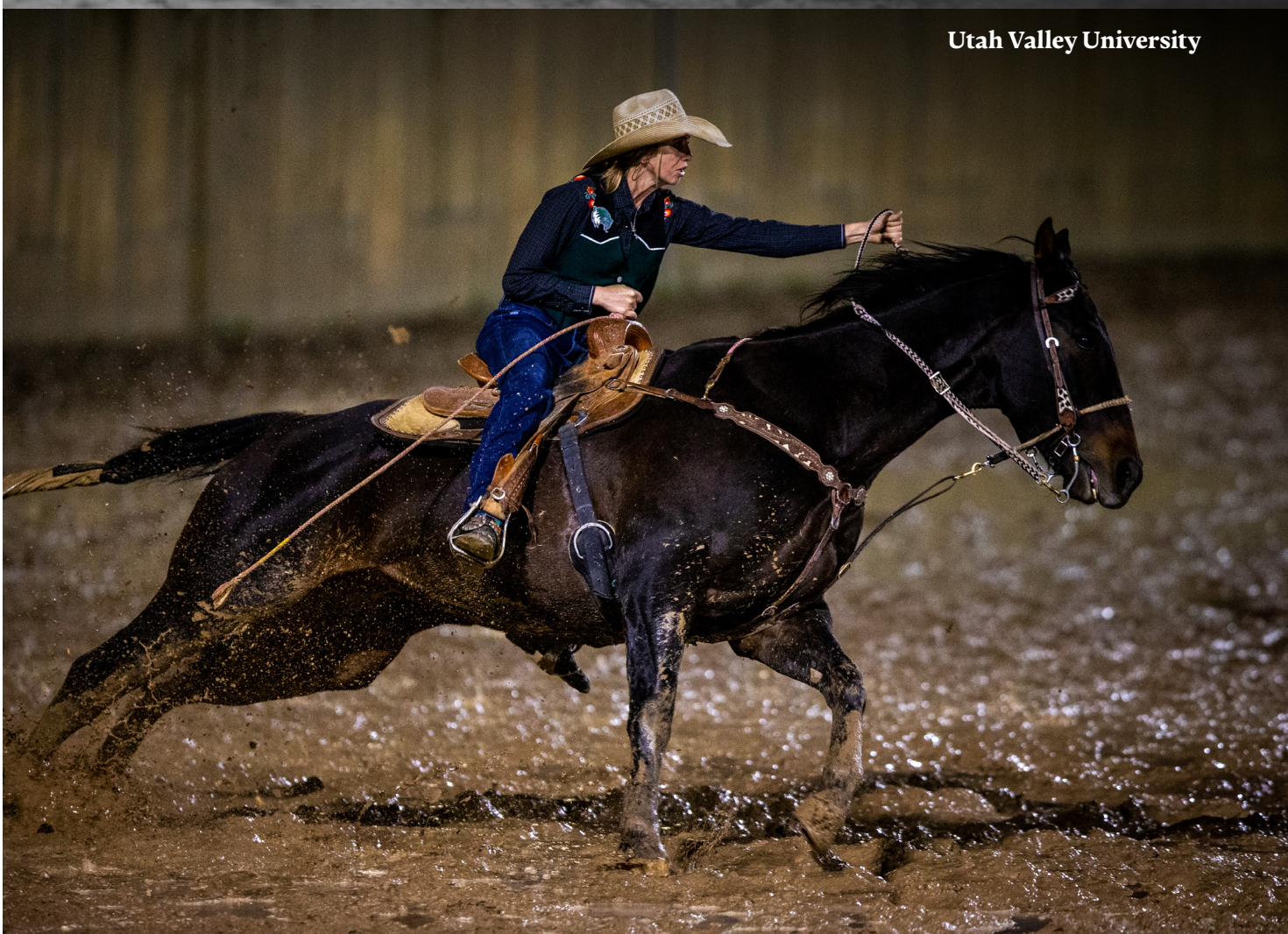
Utah Valley University