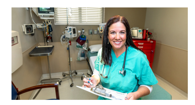
Article adapted from UVU Magazine: The Next Level of Medicine.

comprised of two semesters. The first is lecture and book-heavy, and in the second semester, students participate in hospital rotations that include time spent in the operating room, labor and delivery, and the emergency room. Prior to joining the program, students must complete a year of prerequisite coursework and candidates are admitted through a competitive process.