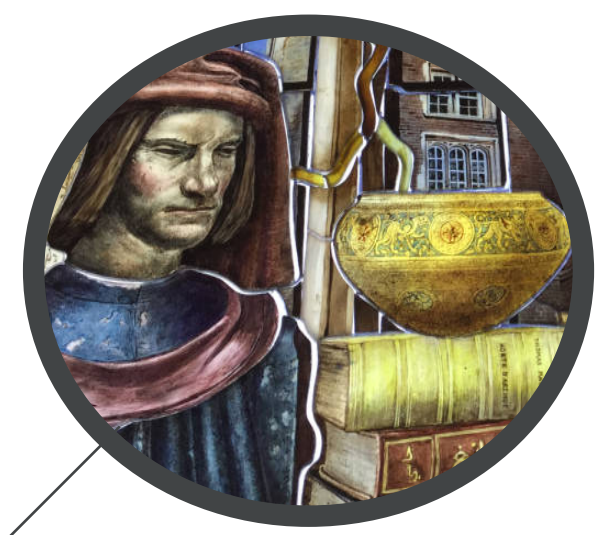
Detail from Roots of Knowledge

aren't often known for their artwork, Roots of Knowledge allows us to blend this spectacular installation depicting the knowledge of the past with the information on our shelves and in our databases to guide students to a bright future where they can contribute to the ongoing story