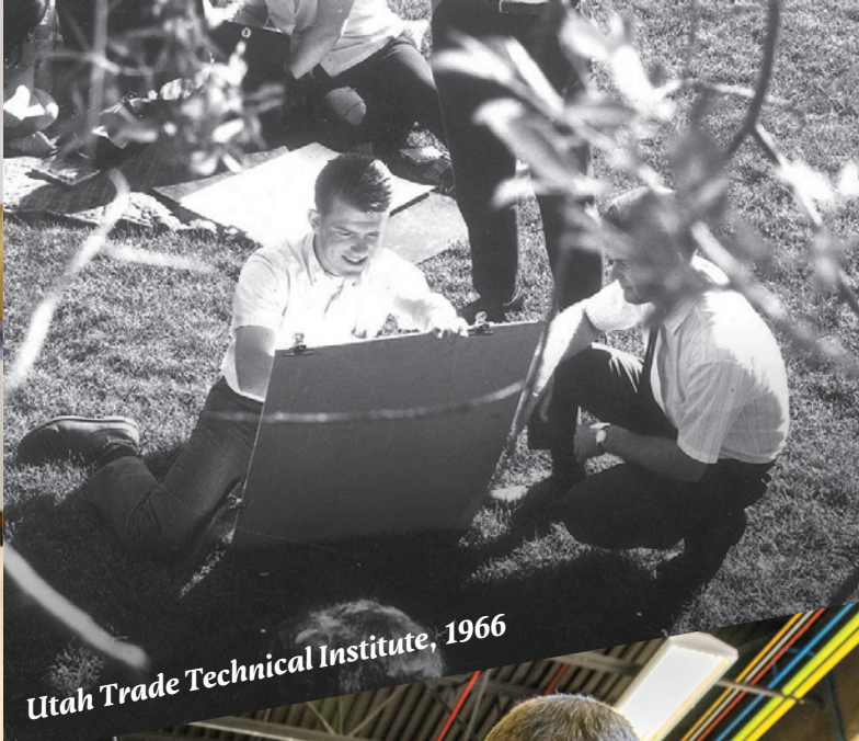
Utah Trade Technical Institute, 1966