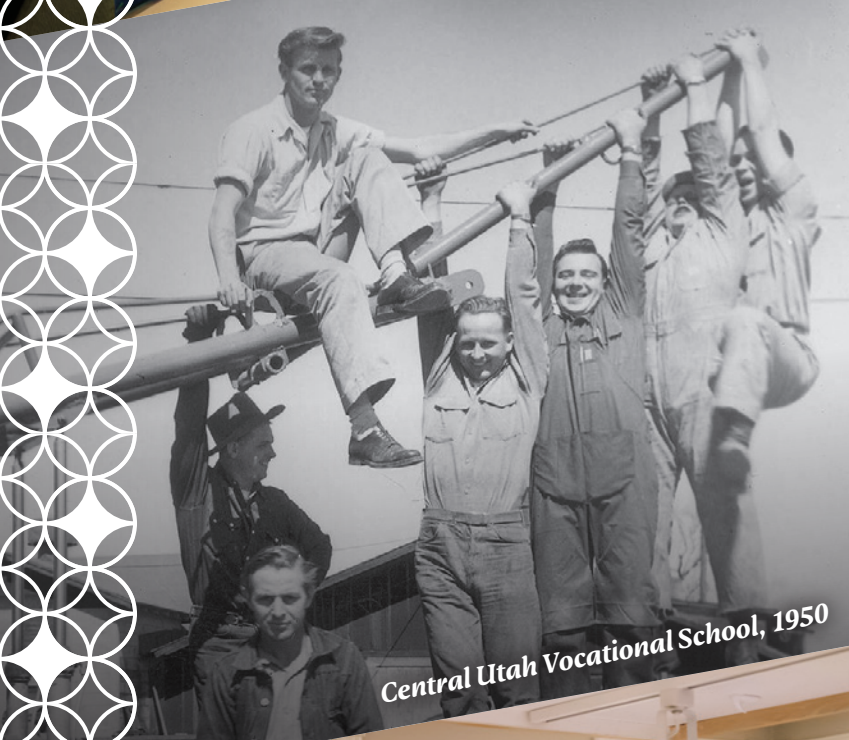
Central Utah Vocational School, 1950