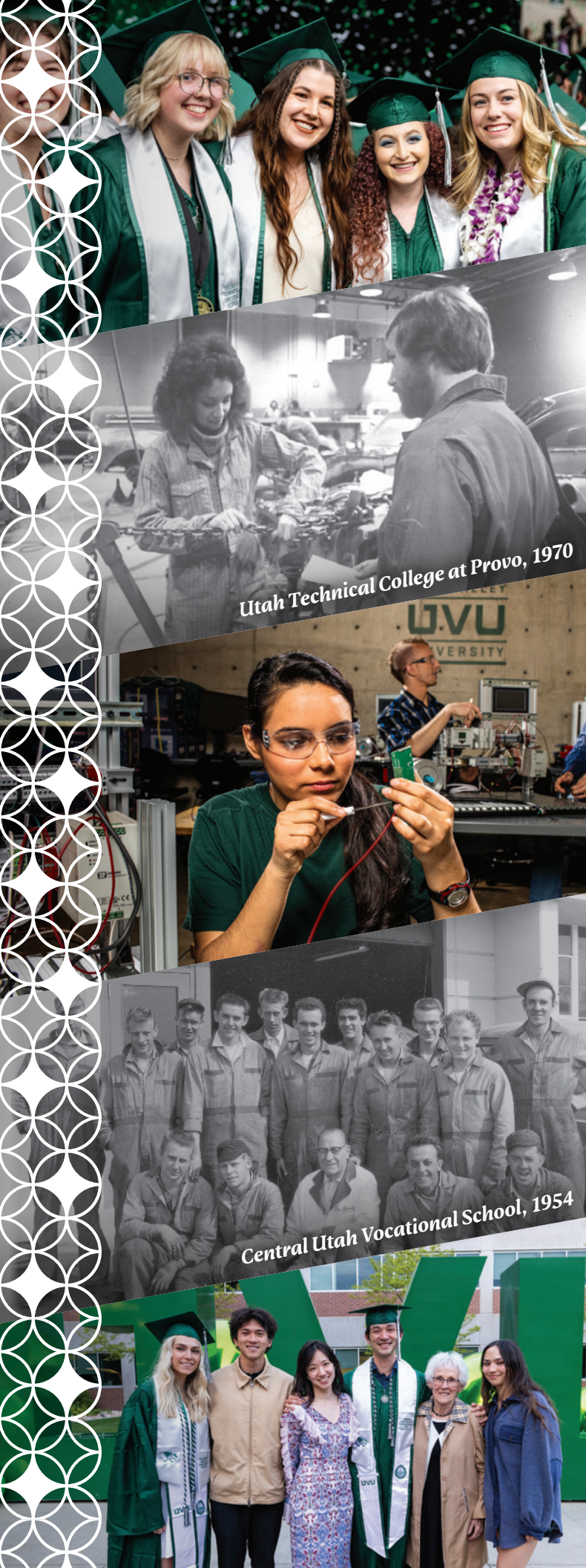
Utah Technical College at Provo, 1970