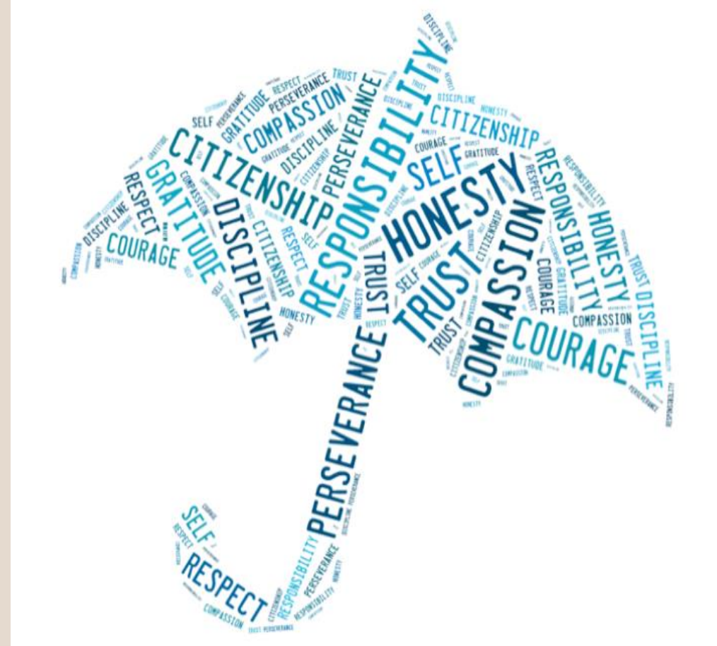
Image from Character Education Resource Center at University of San Diego

List adapted from Bill of Rights Institute Civic Virtues and Vices