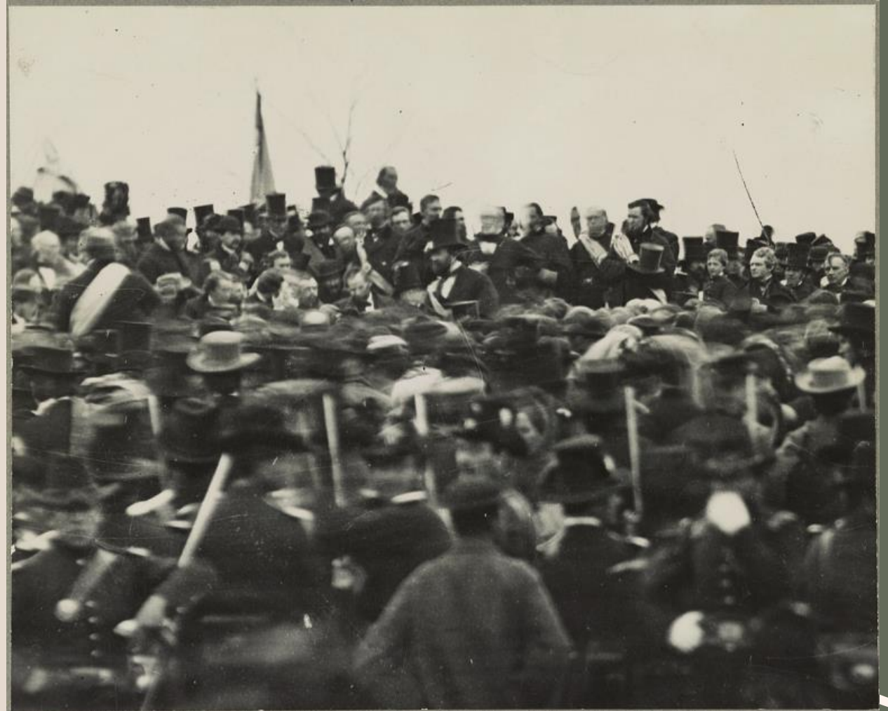
Lincoln's Gettysburg Address, Gettysburg