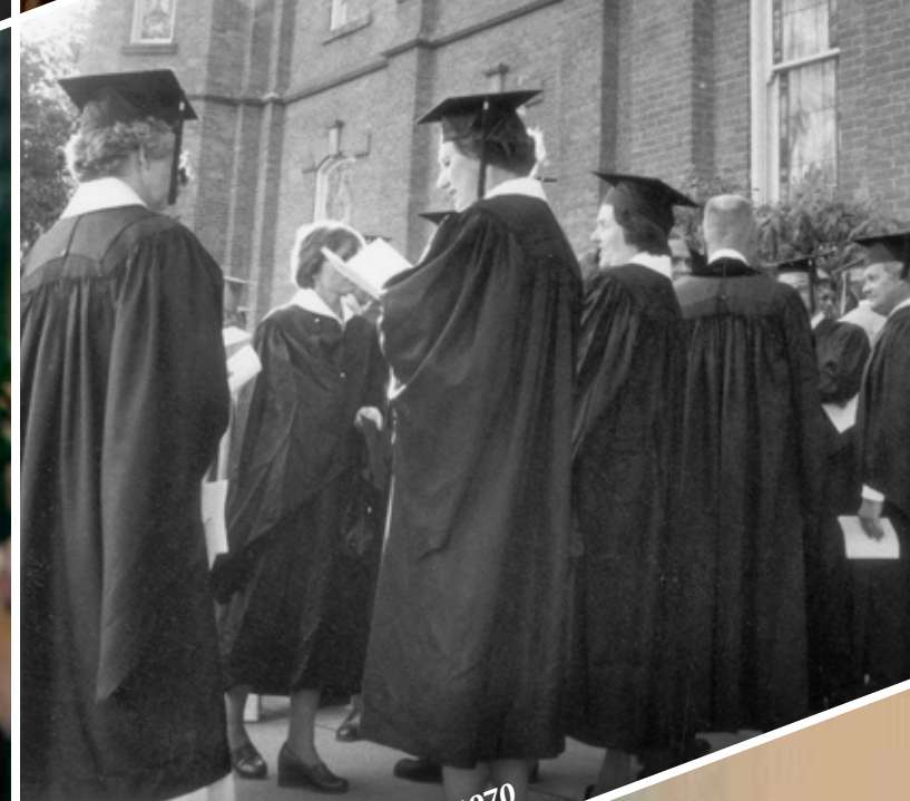
Utah Technical College at Provo, 1970