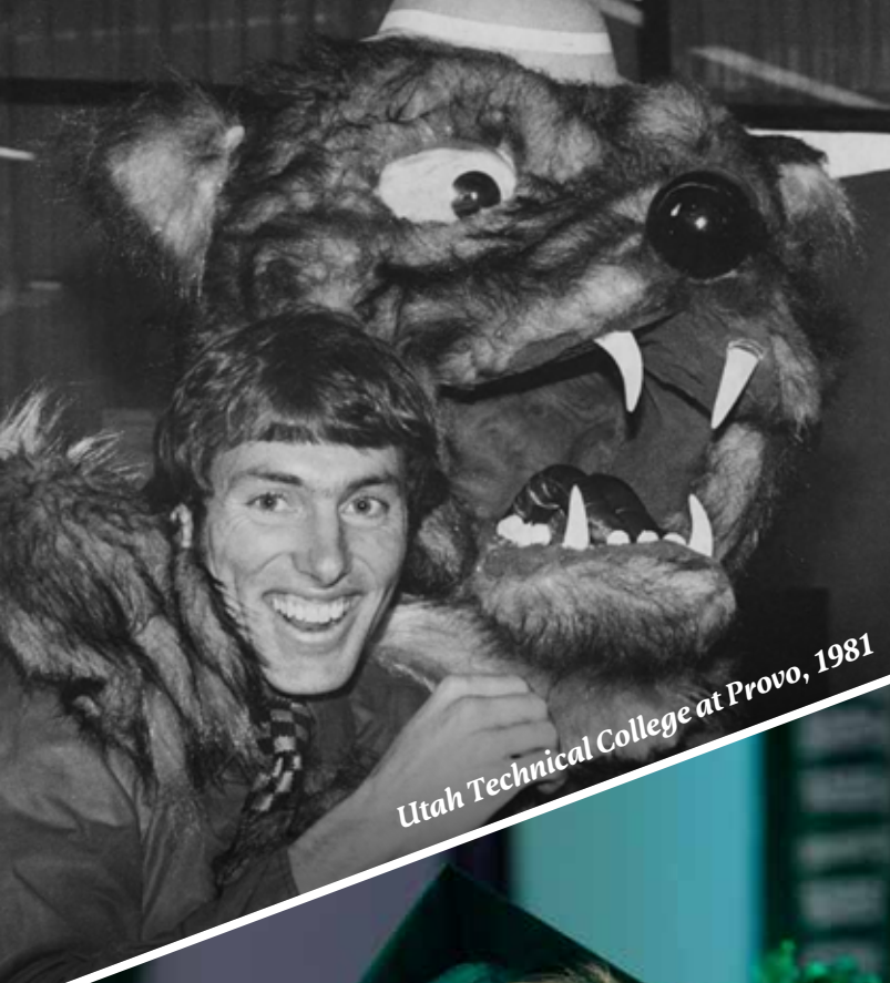
Utah Technical College at Provo, 1981