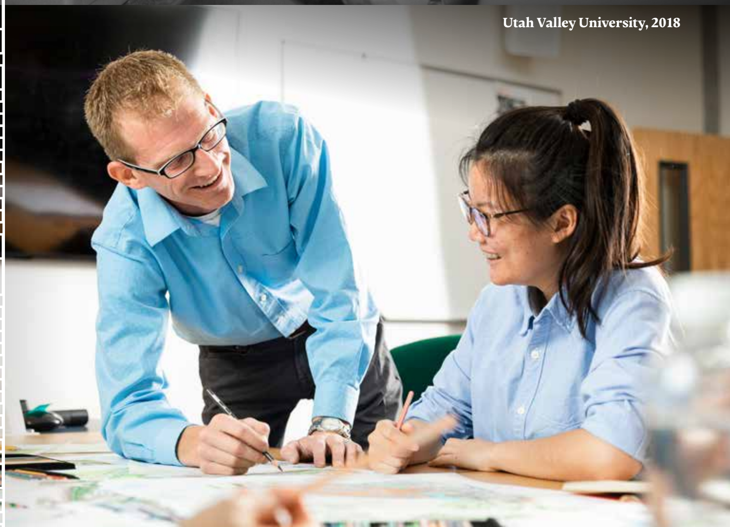
Utah Valley University, 2018

Ever EXAMINING. Ever INSIGHTFUL. Ever INCLUSIVE.