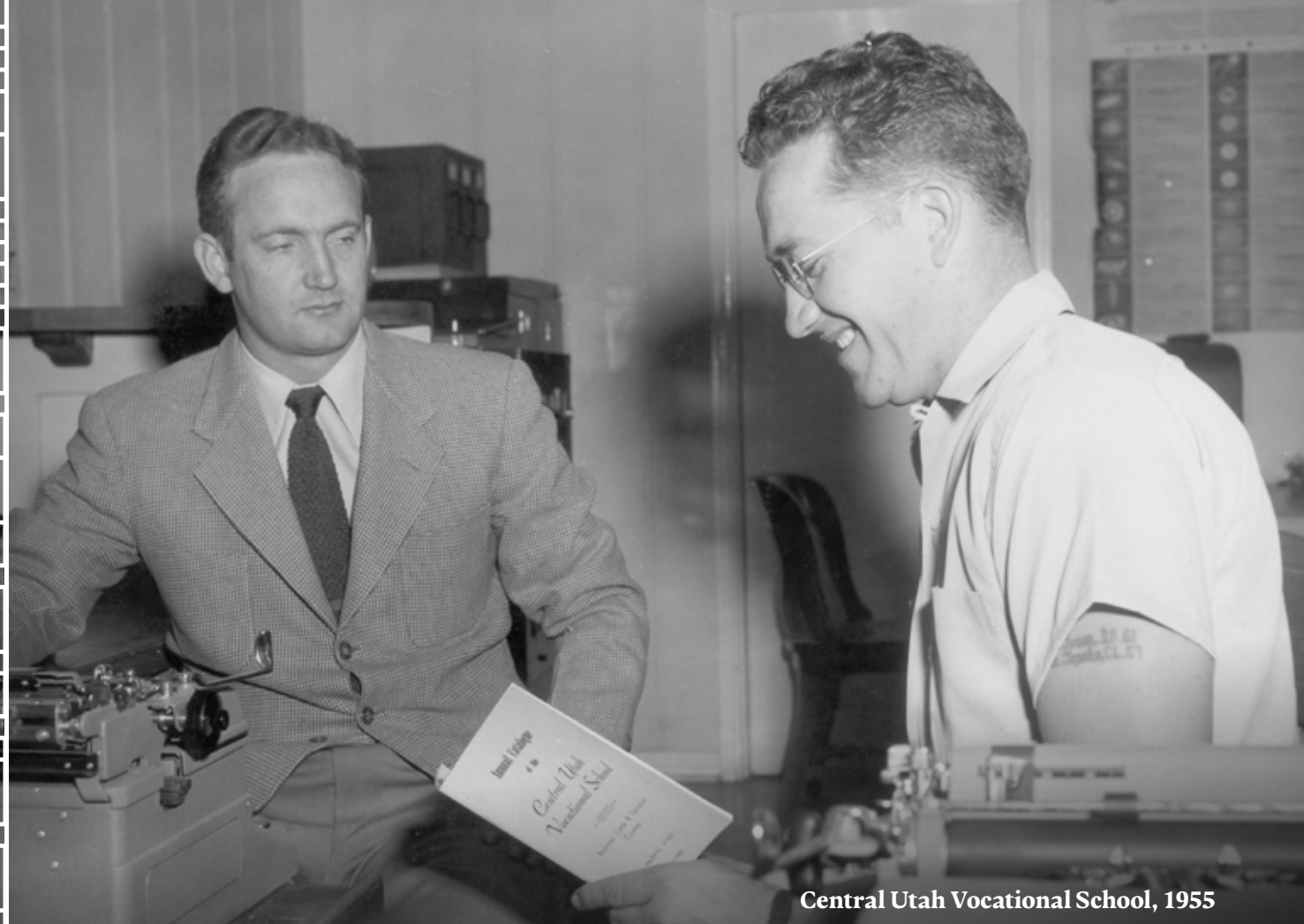
Central Utah Vocational School, 1955