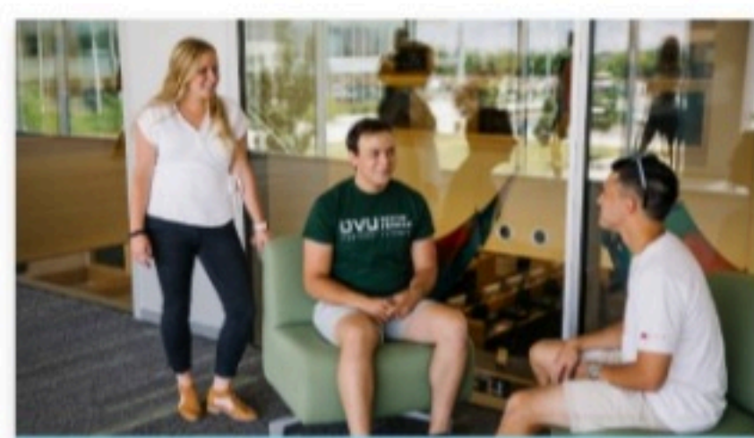
What is a Mentor