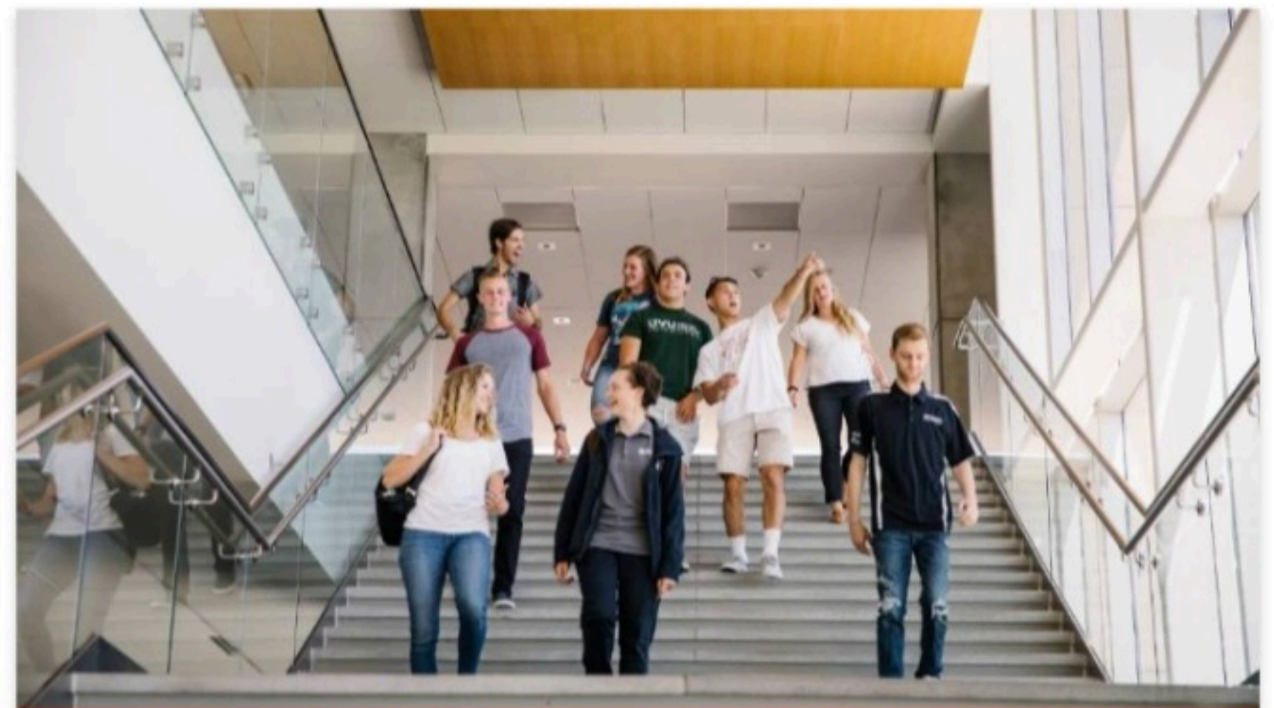
Meet Our Mentors