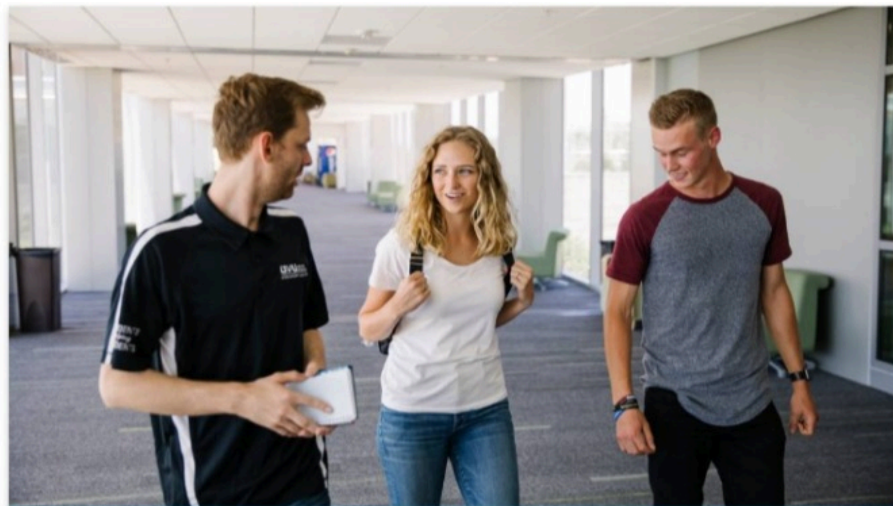
How Can a Mentor Help Me?