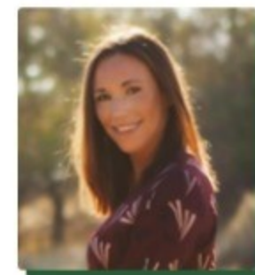
Kelly Bruce Glynn Residence for the Creative Arts

The faculty's unwavering dedication to education establishes a foundation for excellence, fostering an environment where students thrive. The students' remarkable dedication and collaborative approach to learning reflect the outstanding teaching by the faculty, embodying their guidance and inspiration. This community stands as a true hub of academic excellence, dedicated to preparing the next generation of educators."