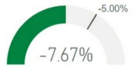
Tuition and Fee per Credit Hour UVU and Peer Schools

UVU 2023-24 Tuition and Fee Rate Difference to Peers