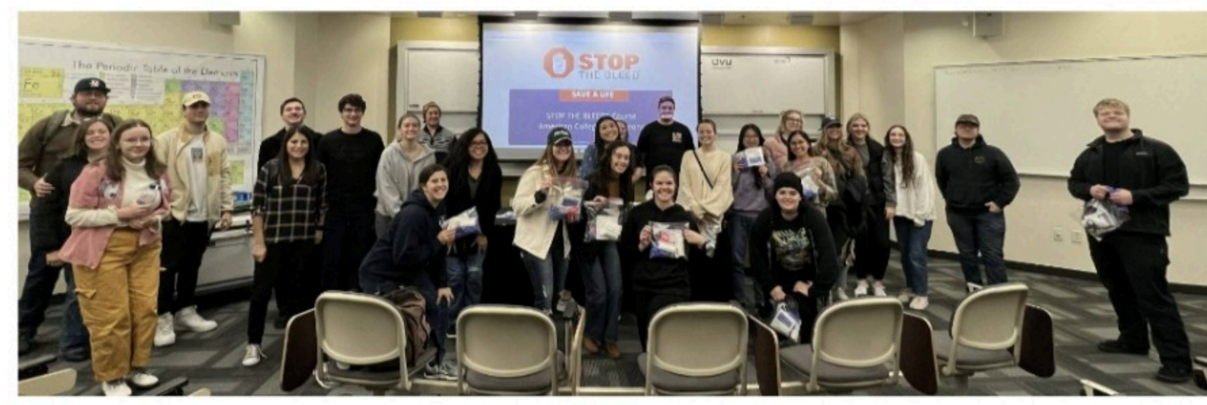
SNA Stop The Bleed Training Spring 2023

The Utah Valley Student Nurses Association is a preprofessional association for nursing students, a constituent member of National Student Nurses Association and Utah Student Nurses Association. UVUSNA provides opportunities for professional networking, leadership, and service. Pre-nursing students are also welcome as members of UVUSNA.