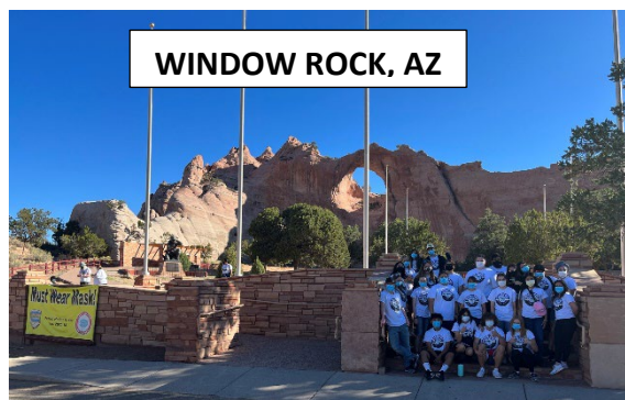
WINDOW ROCK, AZ