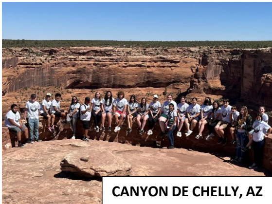
CANYON DE CHELLY, AZ