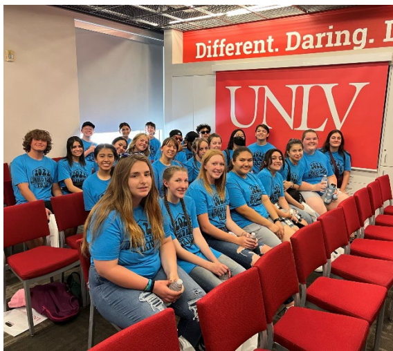
Different. Daring. I.