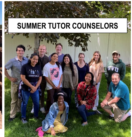
SUMMER TUTOR COUNSELORS