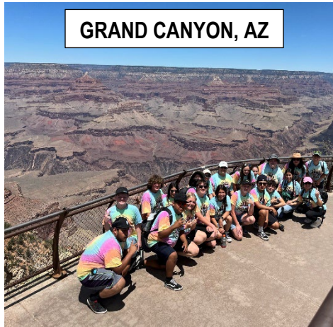
GRAND CANYON, AZ