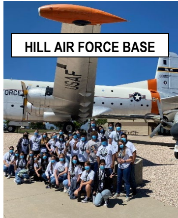
HILL AIR FORCE BASE