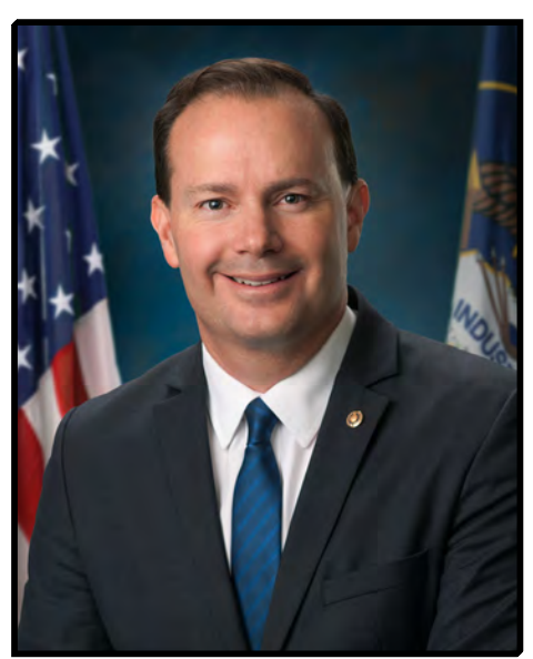
Senator Mike Lee State of Utah