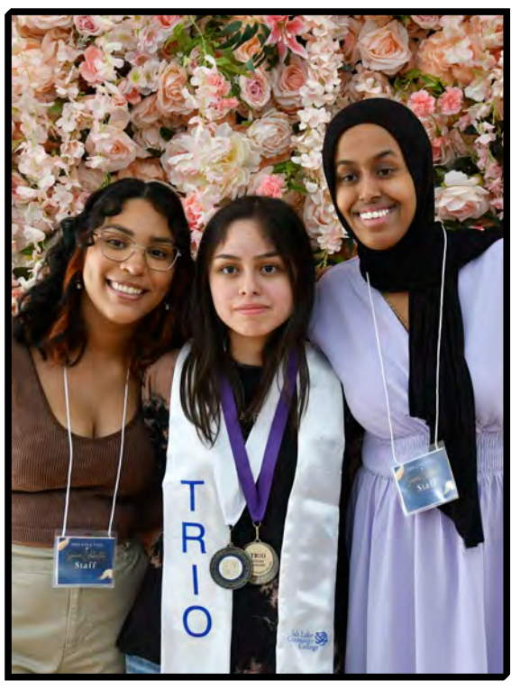
Salt Lake Community College TRIO Talent Search students and staff celebrate graduation.