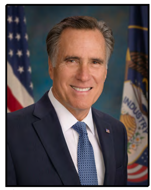
Senator Mitt Romney State of Utah