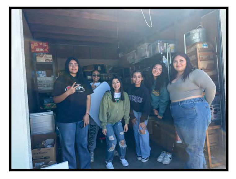
Weber State University TRIO Student Support Services students participate in service projects during Spring Break in San Diego, CA.