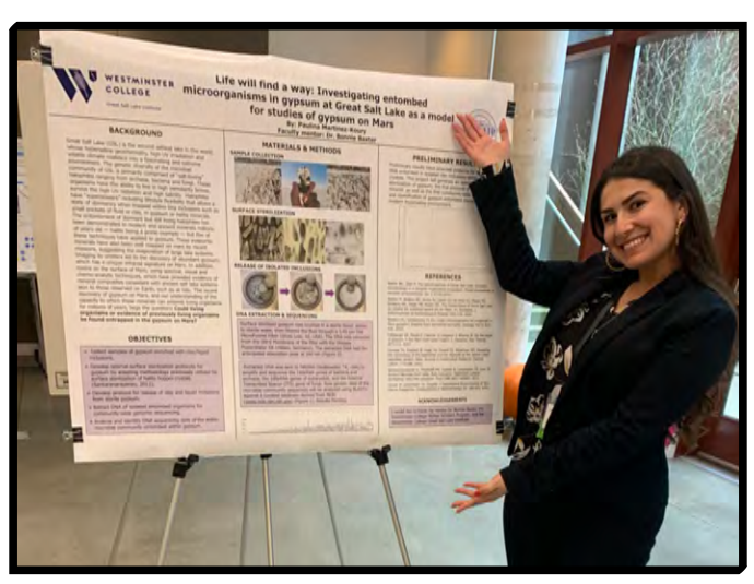
A McNair scholar at Westminster College presents her research.