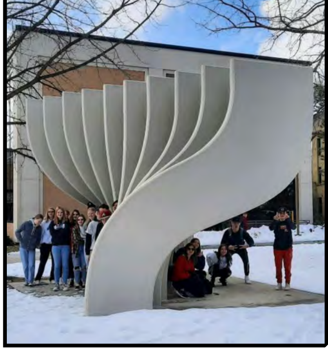
Southern Utah University TRIO Talent Search 9th graders tour Brigham Young University.