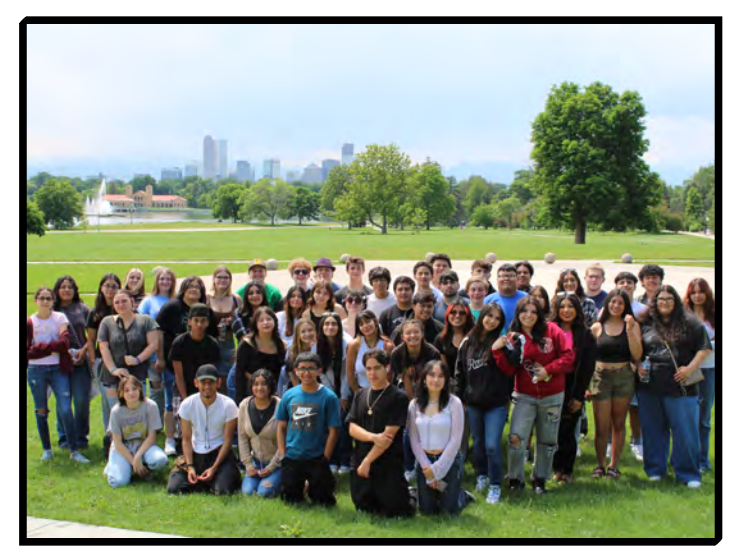
Weber State University Upward Bound students on a college tour in Denver, Colorado during the 2023 summer program.

Seeing my mom work multiple jobs to support my siblings and I while I was growing up made me realize that I had to break down the barriers of being an immigrant who must work extra hard to survive in a different country. Because of TRIO, I can have many more opportunities and know about events that focus on including individuals such as myself. My student support advisor makes me feel valued and encourages me to be persistently ambitious, despite what society has told me growing up. Now, I am entering my senior year of college with confidence that I know exactly what I am doing and how I can achieve my goals.