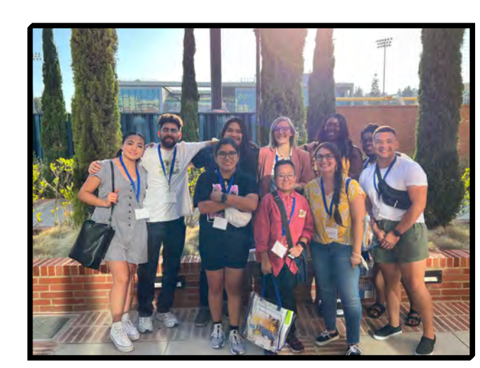
Westminster College McNair scholars at UCLA's McNair conference.