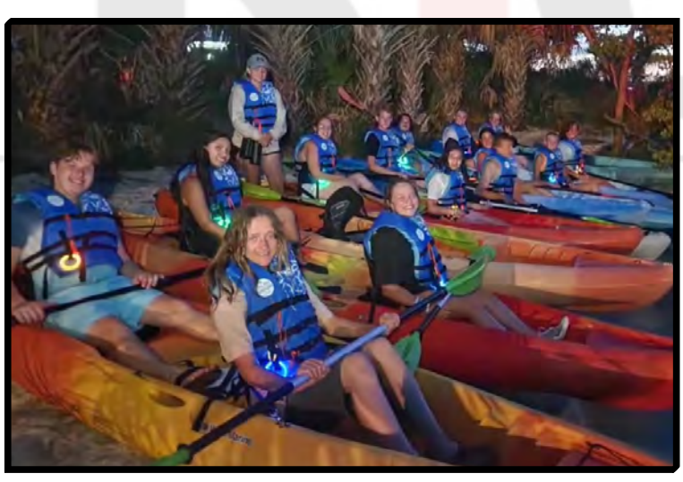
Utah State (Price campus) Upward Bound students who attended the 2023 Summer Program were able to attend a once- in-a-lifetime educational experience, a bioluminescent tour in Cocoa Beach, FL.