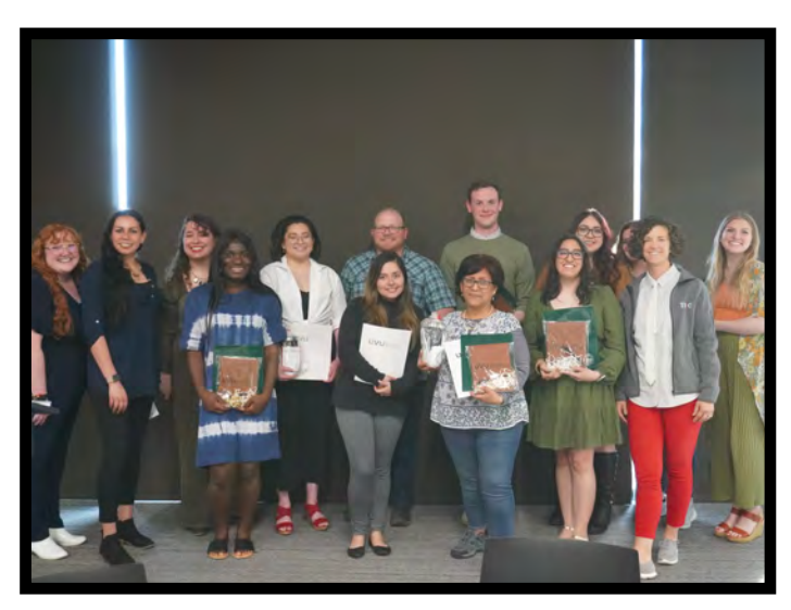
Utah Valley University TRIO undergraduate students participating in a panel discussion.