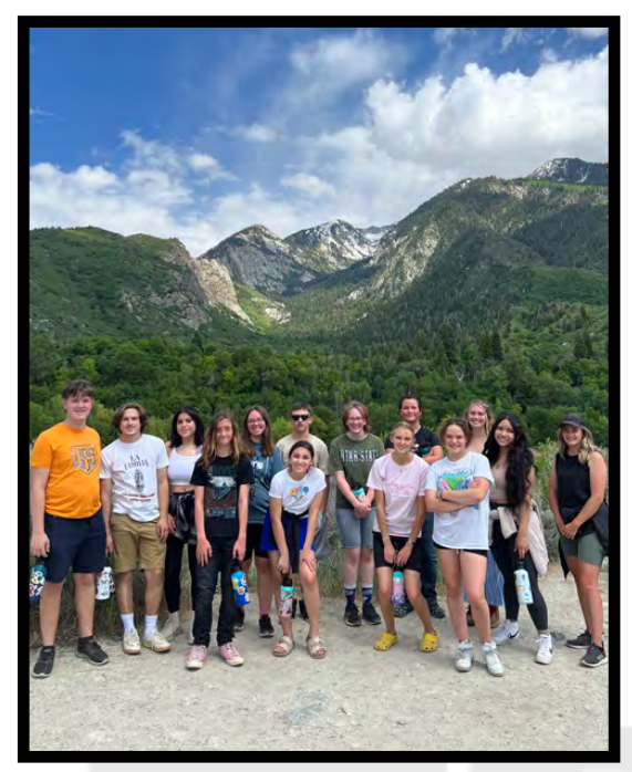
Utah State University (Price campus) Upward Bound students exploring Dimple Dell Regional Park on an environmental adventure.