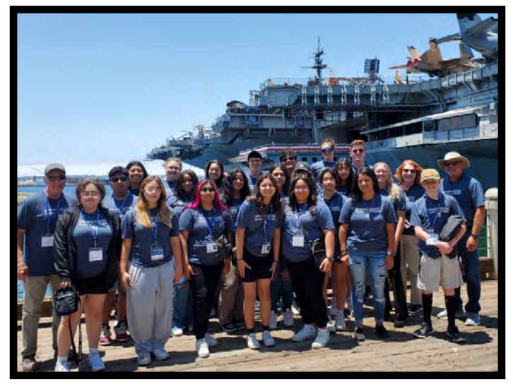
Snow College TRIO Upward Bound students attend a educational trip in San Diego, California as part of the summer program.