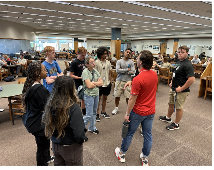
A group of Talent Search seniors getting a tour of Southern Utah University's library.