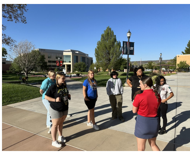
A group of Talent Search seniors getting a tour of Utah Tech University's campus.