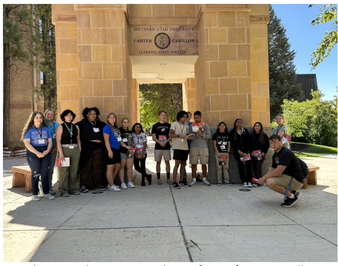
Talent Search seniors standing in front of Carter Carillon Tower on SUU's campus.