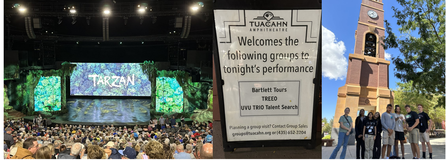
At the end of Day 1, our Talent Search seniors were able to catch the performance of Tarzan at Tuacahn Amphitheatre in St. George (after a rain delay :). Our view of the stage from our seats and the welcome sign from Tuacahn was a nice touch.