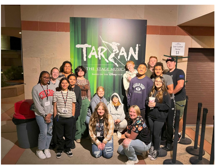
Our seniors after the Tarzan musical at Tuacahn Amphitheatre. Due to the rain delay, we got out of the show late but it was worth it!

Thank you to parents and school administrators allowing your students to attend our college trip tour. We are looking forward to taking a group of our Juniors on a college trip scheduled for March 27th—29th.