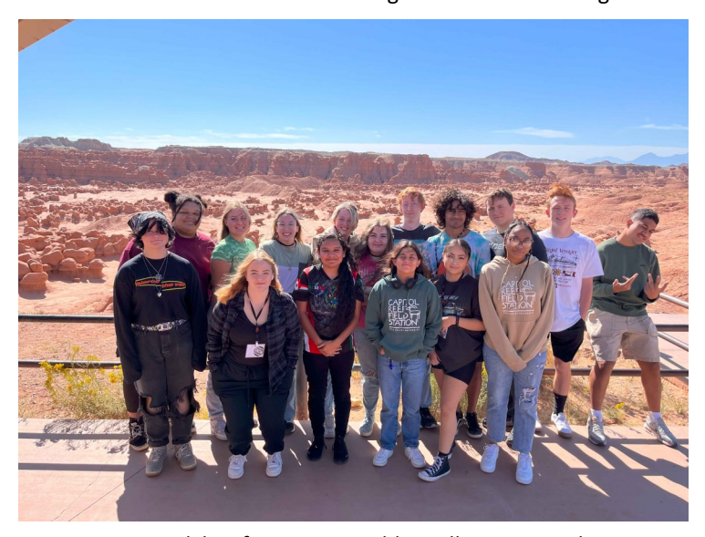
A quick but fun stop at Goblin Valley State Park.