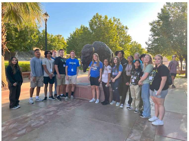
Talent Search seniors on the campus of Utah Tech University.