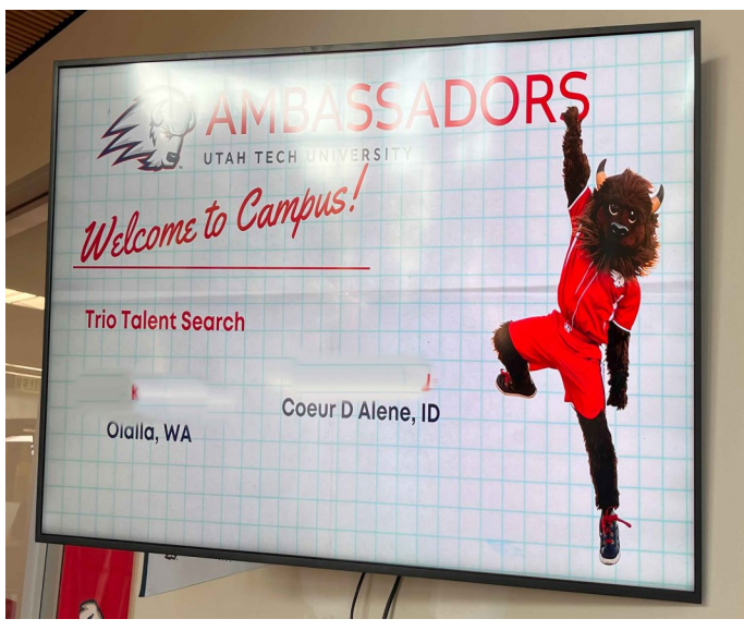
Our TRIO Talent Search campus group tour was welcomed on Utah Tech's campus.