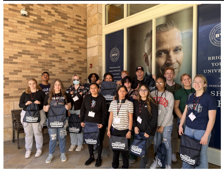
Talent Search seniors holding their SWAG bags at the end of touring Brigham Young University (BYU).