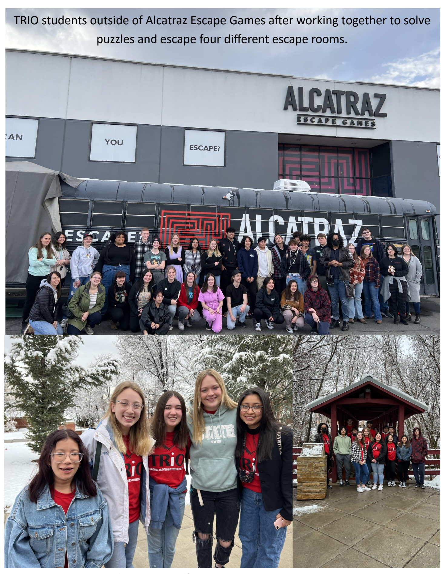
TRIO students on a college tour at Westminster University