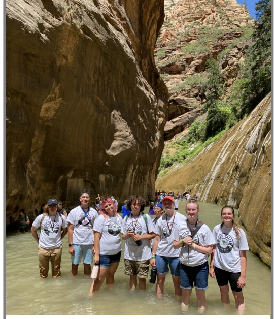
The Narrows @ Zion National Park