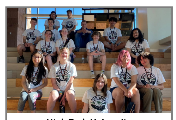
Utah Tech University