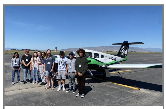
UVU Aviation Program @ Provo Airport Campus