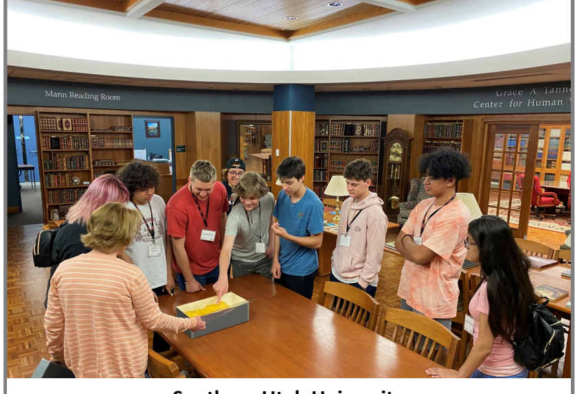
Southern Utah University