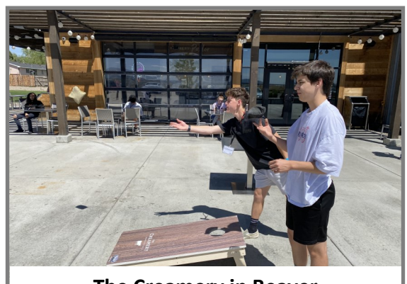
The Creamery in Beaver