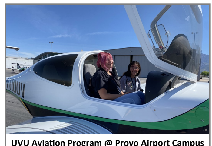
UVU Aviation Program @ Provo Airport Campus