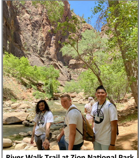
River Walk Trail at Zion National Park